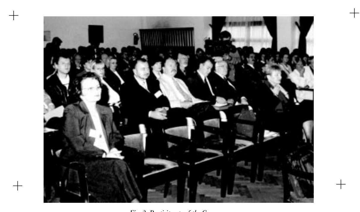
Fig. 3. Participants of the Congress