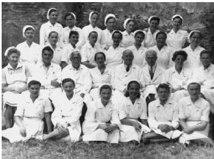
Doctors and nurses of the Department of Ophthalmology. The photo was taken in 1950s.

In the desire to improve versatility, maintain continuous improvement and increase of operative procedures, an old operative room was transformed into two new ones in 2001, which now contain new operative microscope and various modern microsurgical instruments. After completing the renovation of the operative rooms the Clinic has all the necessary resources to perform out-patient surgeries which has become a trend in contemporary ophthalmology.