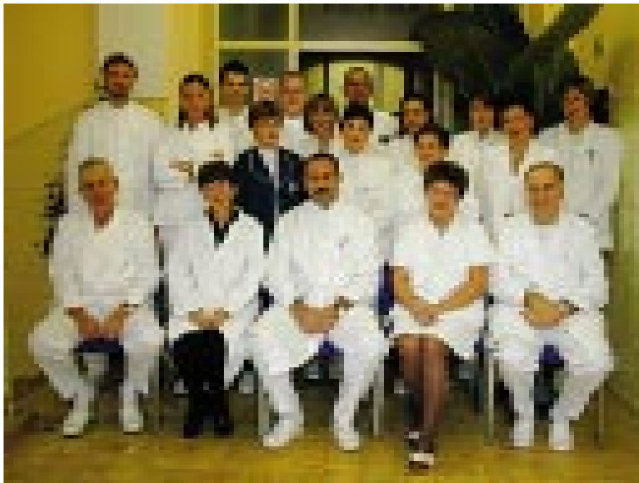
Doctors of the University Department of Ophthalmology. November, 2002.