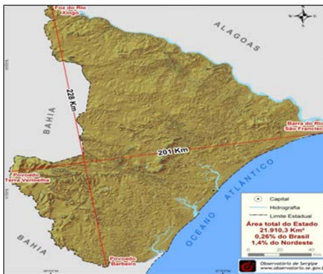
Map 1 – Limits and Extreme Points – Sergipe