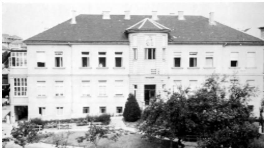
The premises of the University Department of Neurology and University Department of Psychiatry, where Department of Alcoholism and Center for Alcoholism and Other Dependences were founded in 1964.