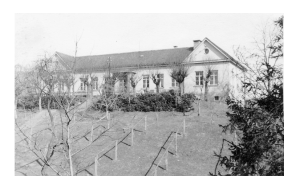
In 1904, Department of Pediatrics was located in this building.