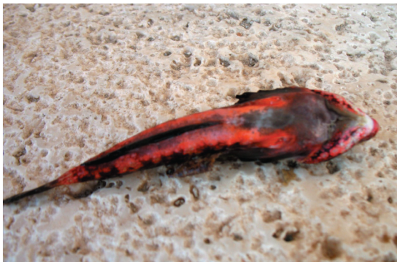
Fig. 2. Ventral view of a specimen of S. sechellensis (Total length 80 mm) from Kastellorizo Isl., Greece, September 2014

A third male specimen of the Seychelles dragonet (total length: 126.2 mm, weight: 20.48 g) was collected on February 1, 2016 from Rhodes, Southeastern Aegean Sea, Greece, during experimental boat-seining in the Gulf of Trianda, Northwest coast of the island (36°25'36.0"N, 28°11'24.1"E) from a depth of 10-30 m, over a sandy to muddy bottom. The specimen was photographed (Fig. 3) and preserved in 10 % formalin at the Hydrobiological Station of Rhodes collection (HSR120).