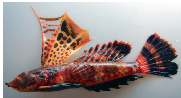
Fig. 3. The male of S. sechellensis (Total length 126.2 mm) caught on 1 February 2016 in Rhodes Isl., Greece.

Identification of individuals was based on FRICKE (1983, 2000).