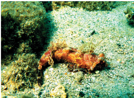
Fig. 1. A male specimen of S. sechellensis (Total length 80 mm) from Kastellorizo Isl., Greece, September 2014.

Two male specimens of the Seychelles dragonet S. sechellensis (Total length 80 mm, Standard length 70 mm) were found in the Port of Kastellorizo Isl., Greece (36°09'01.5"N, 29°35'31.8"E) in September 2014. One of them was photographed with u/w camera (Fig. 1), while the second (Fig. 2) was caught with a small fishing net, identified and photographed out of the water and successively released. The two specimens were observed at a depth of about 3 m, on a muddy and rocky substrate, very close to the shore. Deeper in the same place, where the substratum is finer (silty mud), the Lessepsian fish C. filamentosus , Upeneus pori (Ben-Tuvia & Golani, 1989) Torquigener flavimaculosus (Hardy & Randall, 1983) and Fistularia commersonii (Rüppell, 1835) were also observed.