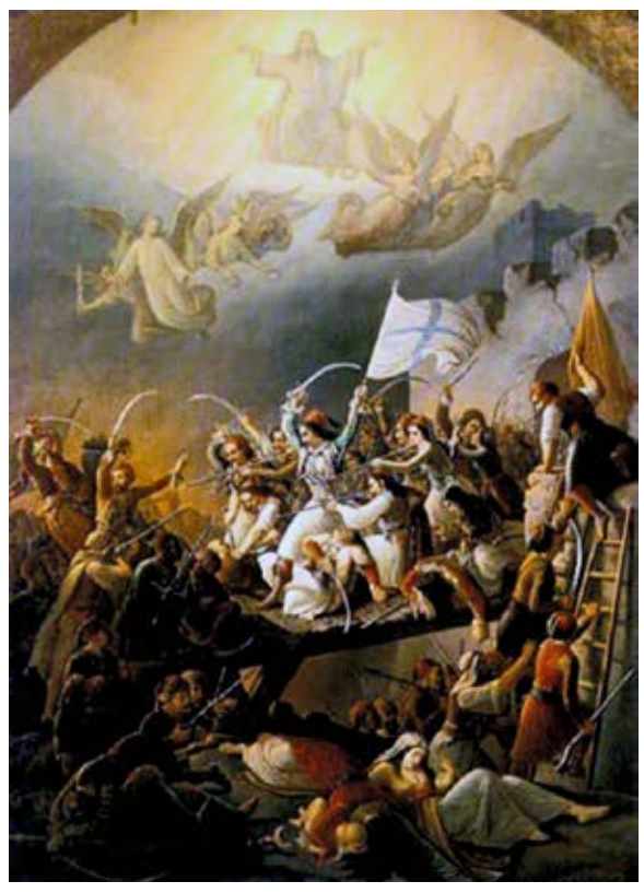
Figure 3 - The sortie from Missolonghi by Theodoros P. Vryzakis, 1855 (National Gallery and Alexander Soutsos Museum, Athens Greece)

after the cessation of publishing of the "Greek Annals" on February 20, 1824 and which was unfortunately lost. A monument to him is found in the Garden of Heroes in Missolonghi.