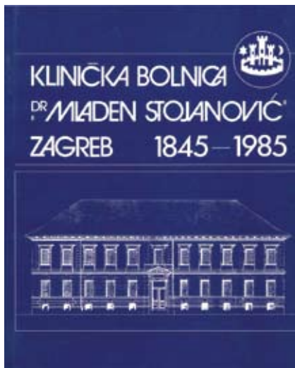
Dr Mladen Stojanović Clinical Hospital, Zagreb, 1845-1985, Zagreb, 1985.