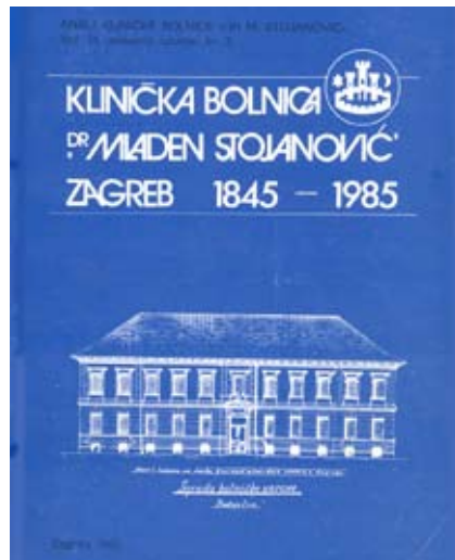
Dr Mladen Stojanović Clinical Hospital, Zagreb, 1845-1985. Annals of Dr Mladen Stojanović Clinical Hospital, Vol. 24. Special Issue No. 2, Zagreb, 1985.