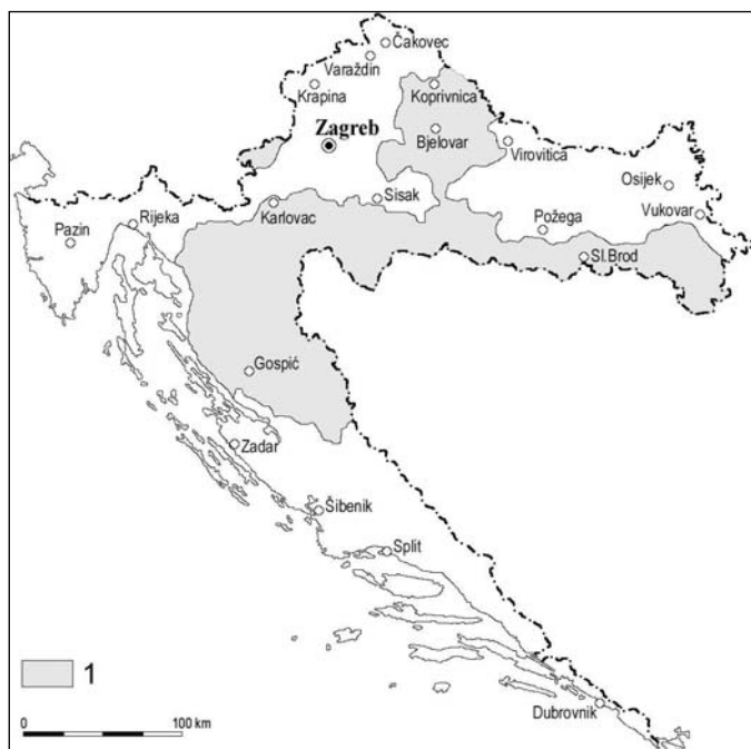
➔ FIGURE 3 Croatia in its current borders with the territory of the former Military Frontier indicated (1)

from the formerly occupied Pannonian areas of Croatia and Hungary to territories south of the Sava and Danube after their defeat at Budapest in 1683, in 1702 (after the Treaty of Karlowitz in 1699) the Slavonian Military Frontier was established along the Sava River. The Austrian authorities continued the process of ethnic change in Croatian territories as they invited settlers to the Military Frontier, mainly (again) Orthodox Vlachs as well as ethnic Serbs. 3