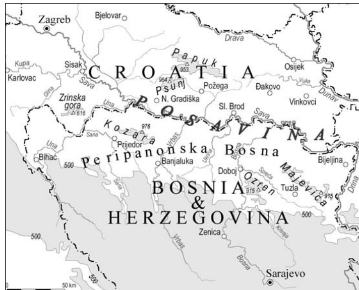
➔ FIGURE 1 Posavina as the border zone between Croatia and Bosnia and Herzegovina

this extended peri-Pannonian Bosnia, the relief is considerably more complex than in the narrower zone along the Sava River.