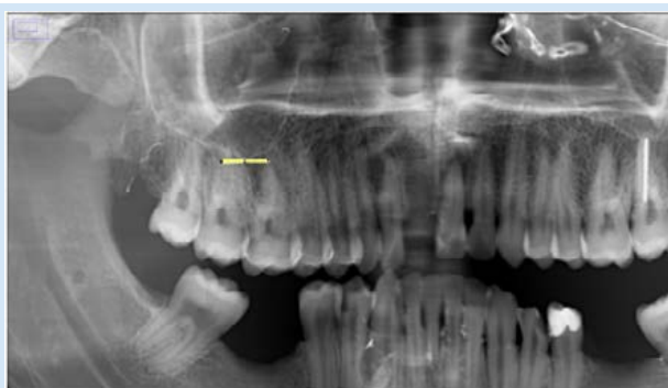
Slika 1. Poboljšani prikaz panoramske rendgenske snimke lubanje, s naglaskom na ravnu liniju iznad jedne ortodontske žice (10 mm)

To standardize the level of distortion of the panoramic radiograph a device (Veraviewepocs 2D ® , J MORITA, MFG.