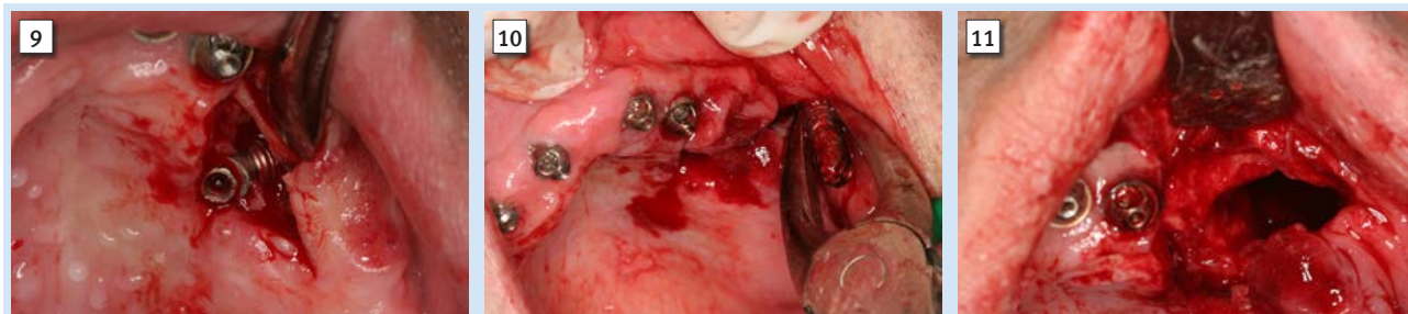
Slika 9. Podignuti režanj s prikazom izloženih navoja implantata

Figure 9 Flap elevation revealing the exposed implant threads.