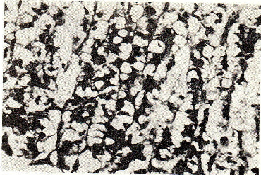
Fig. 2. Adrenal cortex of a rabbit, administered intravenously manganese chloride (2.5 mg/kg/day) for 60 days, showing large vacuoles in the cells of the zona glomerulosa and pyknotic nuclei. H & X 640