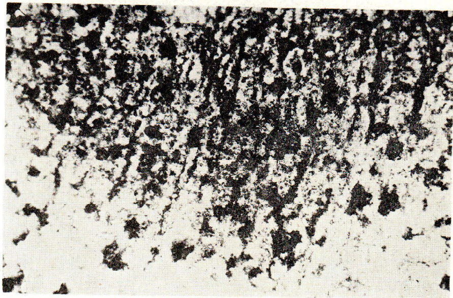
Fig. 3. Adrenal cortex of a normal rabbit showing cholesterol deposits. Frozen section, Schultz method X 160