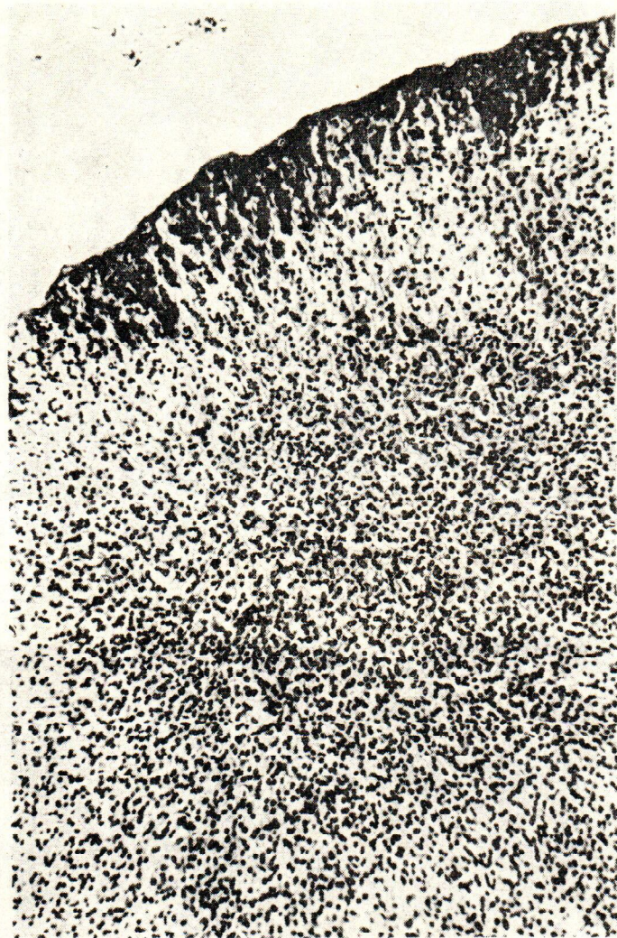
Fig. 1. Adrenal cortex of a normal rabbit. H & E X 160