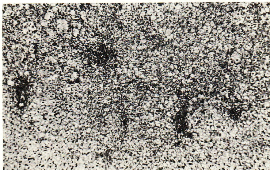
Fig. 5. Adrenal cortex of a rabbit, administered intravenously manganese chloride (2.5 mg/kg/day) for 90 days, showing degeneration and leukocytic infiltration in the zona glomerulosa and zona fasciculata. H & E X 160