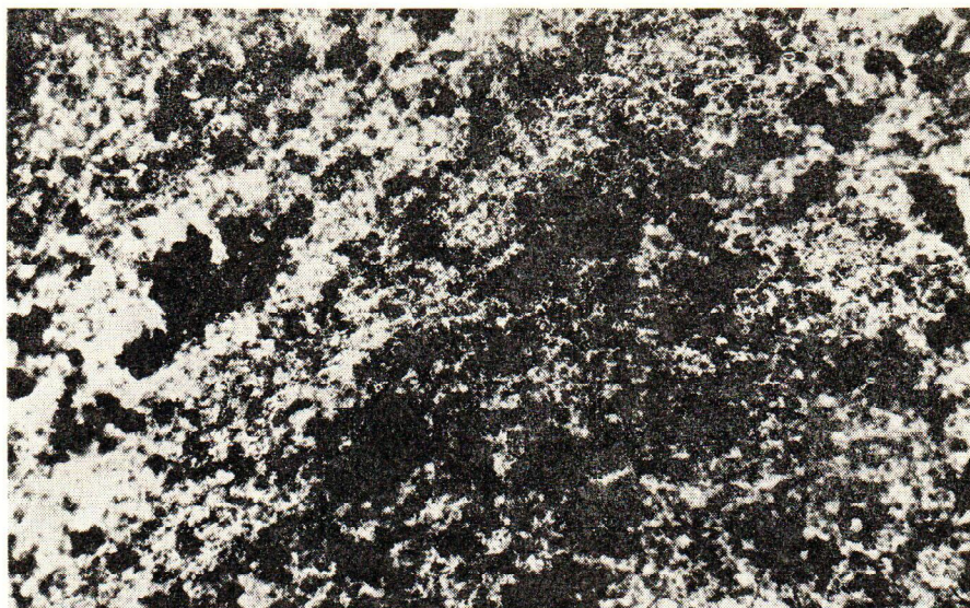
Fig. 4. Adrenal cortex of a rabbit administered intravenously manganese chloride (2.5 mg/kg/day) for 60 days, showing increased cholesterol in the zona glomerulosa. Frozen section, Schultz method X 160