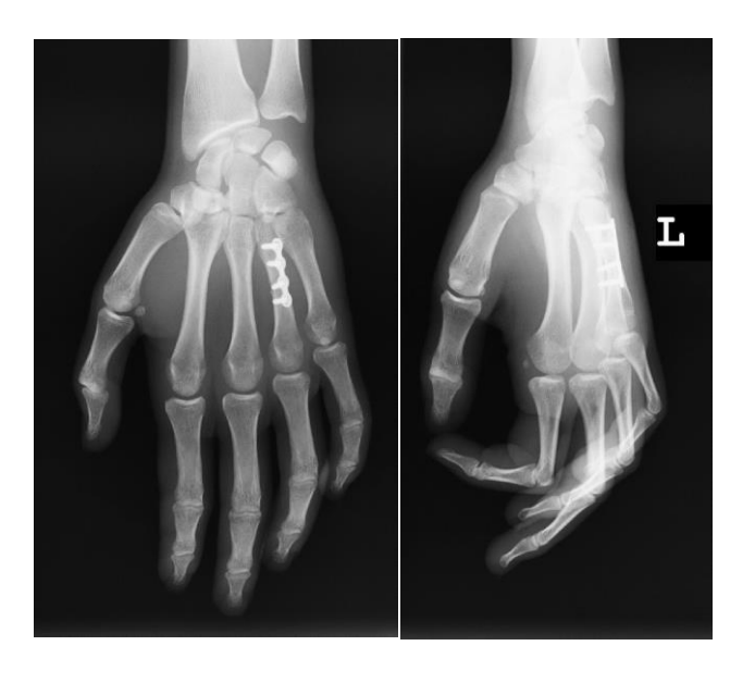
Picture 3 a, b Anteroposterior (a) and laterolateral (b) view of radiographic imaging of patient with transverse 4<sup>th</sup> metacarpal shaft fracture after open reduction and internal fixation with low profile plate. Slika 3.a i 3.b Anteroposteriorni (a) i laterolateralni (b) pregled radiografske slike pacijenta s poprečnim prijelomom 4. metakarpalne kosti s otvorenom redukcijom i unutarnjom fiksacijom s pločicom niskog profila

The adequate position of the osteosynthetic material was confirmed with intraoperative radiographic imaging in two planes, anteroposterior and laterolateral view. The operative incision was closed typically, including dissected juncturae tendinea.