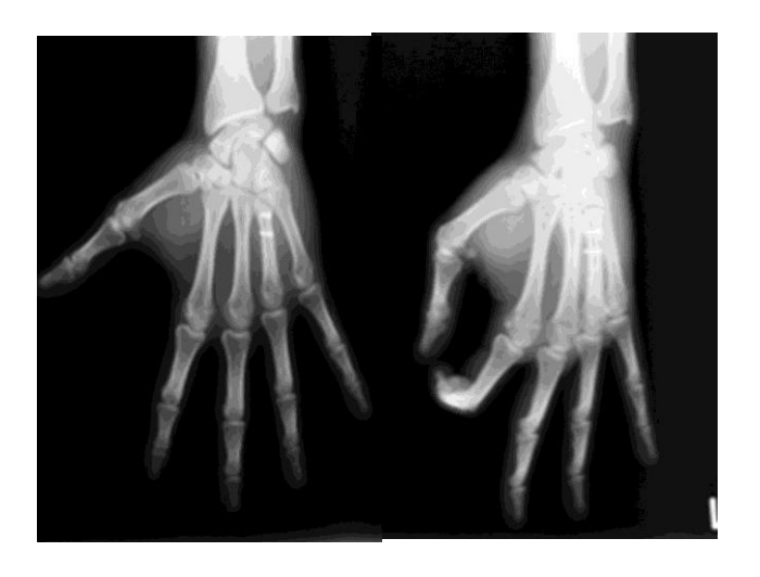
Picture 4 a, b. Anteroposterior (a) and laterolateral (b) view of radiographic imaging of patient with oblique 4th metacarpal shaft fracture after open reduction and internal fixation with 2 lag screws.

Slika 4.a i 4.b Anteroposteriorni (a) i laterolateralni (b) pregled radiografske slike pacijenta s kosim prijelomom 4. metakarpalne kosti s otvorenom redukcijom i unutarnjom fiksacijom s 2 lag vijka