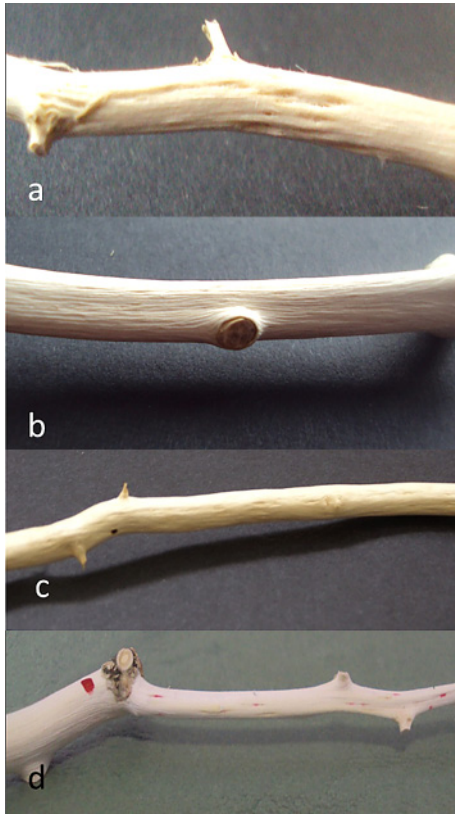
Figure 2. Stem-pitting (SP) symptoms caused by Citrus tristeza virus polyphytetic isolate 32. a) severe SP on Mexican lime branch, b) mild to severe symptoms of SP on sweet orange, c) mild to severe SP on grapefruit stem, d) mild SP on lateral branch of sweet orange on the sour orange rootstock

lime inoculated with isolate 32 (Figure 2a) and in sweet orange (Figure 2b) in severe form. In grapefruit plants (Figure 2c) it was also mild to severe. In sweet on sour orange (Figure 2d), and C. wilsonii SP was observed in mild form suggesting the severe SP pathogenic potential of 32 polyphytetic isolate. The remarkable feature of stem pitting syndrome is the high degree of specificity. For example, some CTV isolate can provoke SP reaction in sweet orange, but not in grapefruit (Garsney, 2005; Hilf et al., 2005). In our study polyphytetic isolate caused SP in all relevant SP bioindicators as well as in C. wilsonii and sweet/sour orange. Isolate 32 caused the most severe SP and other symptoms comparing to all tested isolates. As stated before, the mechanism of symptoms expression is not known, but the interaction between proteins of different CTV isolates present in the inoculum, could affect the symptoms appearance (Nchongboh et al., 2014).