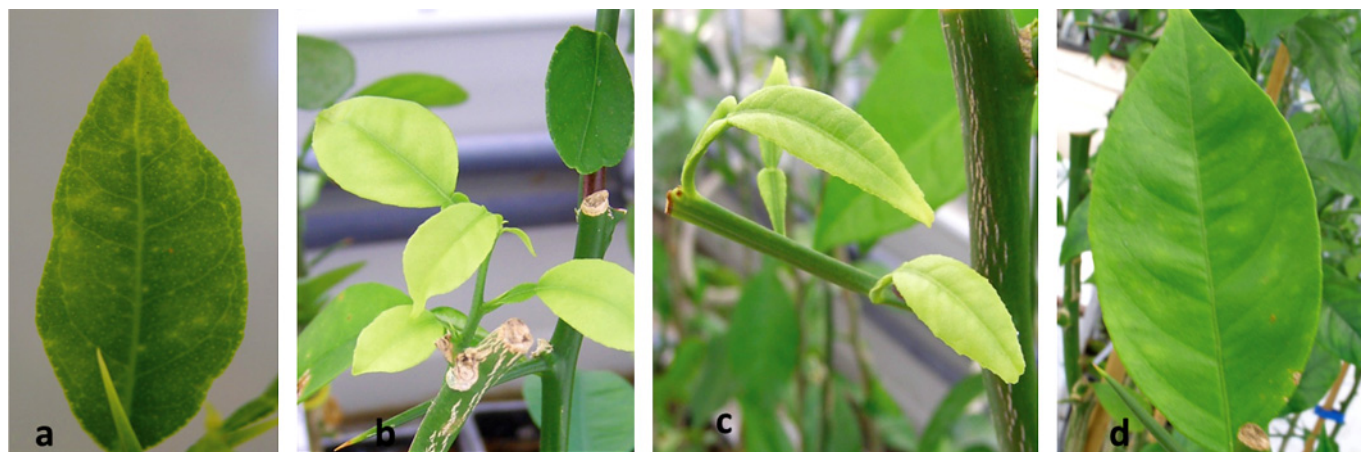
Figure 1. Foliar symptoms of Citrus tristeza virus caused by polyphyletic isolate 32: a) vein clearing and chlorosis on Mexican lime, b) chlorosis and seedlings yellows on grapefruit seedling, c) chlorosis and stunting of sour orange, d) local chlorosis on sweet orange.

efficient as ELISA test for routine CTV detection (Hančević et al., 2012), we used it to check virus presence by blotting young shoots on nitrocellulose membrane. According to the positive DTBI reactions, our results showed that early transfer of virus and its sufficient multiplication to the level of DTBI detection in high percentages occurred in sweet on sour orange, grapefruit, Satsuma mandarin and C. wilsonii . Although Mexican lime is considered as a general and most susceptible bioindicator of tristeza disease and presumably good host for virus multiplication (Folimonova et al., 2008), its susceptibility to CTV infection was mild.