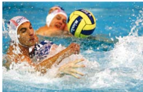
Figure 1. Close contact between players may result in different injuries of the head, face, and hand.

Otitis externa is an inflammatory process of the external auditory canal. It is so common among people who spend many hours in water that it has be-