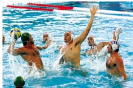
Figure 3. During the late cocking stage of the shot at goal, the player's shoulder is in the position of abduction and maximal external rotation, which may result in the development of internal impingement.

Injury to the rotator cuff among water polo players can include tendinopathies, partial thickness tears, and full thickness tears. In younger age groups, repetitive microtrauma and macrotrauma are the main causative factors, but with aging the etiology of the rotator cuff lesions shifts to degenerative. The diagnosis is based on detailed clinical examination, followed by ultrasonography and magnetic resonance imaging (MRI) (29,30). Although these imaging methods show similar accuracy in diagnosis of rotator cuff lesions, significant advantage of MRI is its ability to show the concomitant pathologic le-