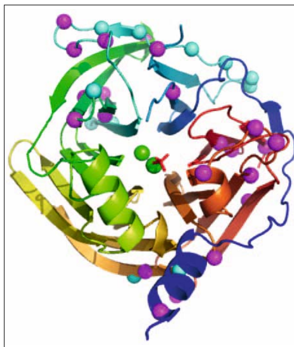
Figure 2 Cartoon image of the 6-bladed beta-propeller structure of the recombinant PON1 variant G6E2. The variant's mutated residues, relative to wild type rabbit PON1, are shown as magenta and cyan balls, the cyan balls indicating unique mutations in G2E6 not shared by the 5 other variants of PON1 that failed to crystallize. The two calcium ions are shown as green balls, and the phosphate ion as a red stick model. Two of the blades, 3 (green) and 4 (yellow), are mutation-free.

The upper of the two calcium ions seen in the crystal structure, Ca-1, lies at the bottom of the active-site cavity, together with a phosphate ion coming from the mother liquor (14). One of this phosphate's oxygens is only 2.2 Å from Ca-1. This phosphate ion may be bound in a mode similar to the intermediates in the hydrolytic reactions catalyzed by PON, with the oxygen adjacent to Ca-1 mimicking the oxyanionic moiety of those intermediates stabilized by the positively-