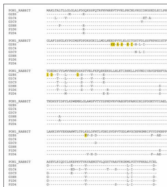
Figure 1 Sequence alignment of rabbit PON1 with six variants for which crystallization trials were performed. G2E6 is the variant which produced the crystals whose X-ray structure was solved. For each sequence, only the residues that differ from the sequence of rabbit PON1 are shown. Mutations unique to variant G2E6 are highlighted in yellow.

RePON1-G2E6 exhibits 91 % homology to the wt rabbit PON1 (Figure 1), with the majority of variations deriving from human, mouse, or rat wt PON1. Rabbit