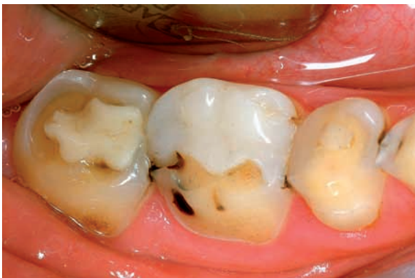
Slika 5. Izdignuti kompozitni ispuni donjih zuba Figure 5 Raised composite restorations of mandibular teeth