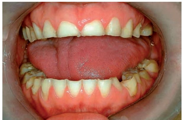
Slika 6. Znatno smanjena vertikalna dimenzija zuba Figure 6 Significantly decreased vertical dimension

materijalima može se primijeniti na zube s minimalnom erozijom ili one s dentinskom preosjetljivošću, a zubi s opsežnim erozijama cakline koje rezultiraju smanjenom vertikalnom dimenzijom okluzije te prednjim otvorenim zagrizom, zahtijevaju kompletno rekonstruiranje protetskim nadomjescima. Naža-