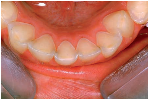
Slika 3. Opsežna dentalna erozija donjih zuba Figure 3 Extensive dental erosion of mandibular teeth