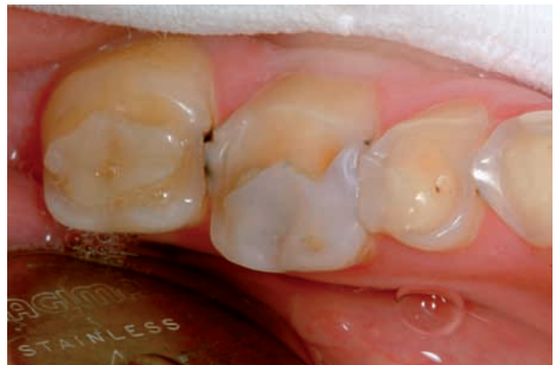
Slika 4. Izdignuti kompozitni ispuni gornjih zuba Figure 4 Raised composite restorations of maxillary teeth