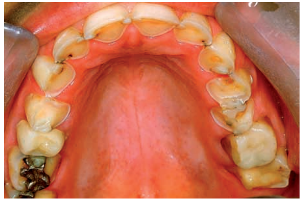
Slika 2. Opsežna dentalna erozija gornjih zuba Figure 2 Extensive dental erosion of maxillary teeth