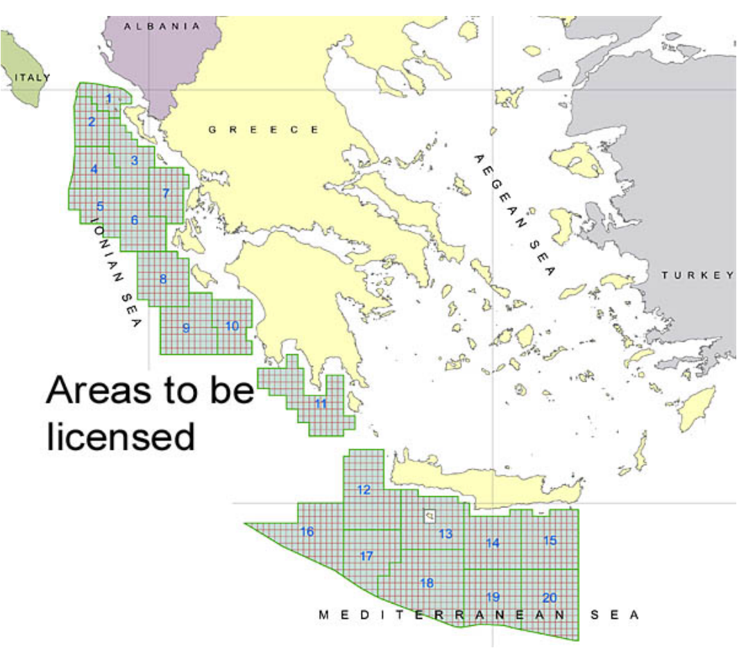
Figure 3: Exploration blocks along Western and Southern Greece

the second international licensing round, whose deadline expired in July 2014. Prerequisites for attracting international companies in Greek gas E&P include resolving the Greek political decision-making standoff; the approval of a new regulatory framework for the gas sector; and the appointment of specialized personnel at the Greek Hydrocarbon Management Company (EDEY) to speed tender procedures.