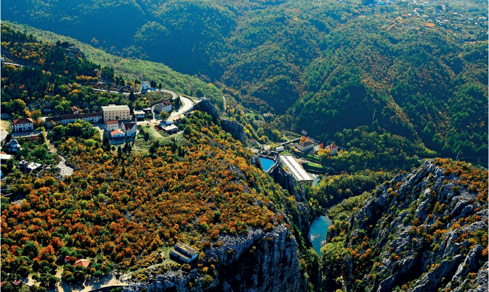
Figure 1. Kraljevac Hydro power plant on the Cetina river

are carried out by HEP-Proizvodnja d.o.o. (HEP Generation), which is responsible for the generation of electricity and thermal (heat) energy. The Group benefits from a diversified generation mix, which includes 26 hydro power plants with an aggregate total installed capacity of 2,220 MW and NPP Krško which has 696 MW of installed capacity (of which 348 MW is allocated to the Group). The Group's generation mix also includes eight thermal power plants with total installed capacity of 1,905 MW, of which 716 MW is natural gas, 892 MW is oil and 297 MW is coal.