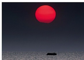
A overcrowded inflatable boat with Syrian refugees drifts in the Aegean sea between Turkey and Greece after its motor broke down off the Greek island of Kos (Yannis Behrakis, Thomson Reuters - August 11, 2015).

The New York Times and Thomson Reuters shared The Pulitzer Prize for breaking news photography for coverage of Europe's refugee crisis.