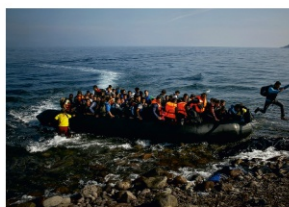
An Afghan migrant jumps off an overcrowded raft onto a beach at the Greek island of Lesbos (Yannis Behrakis, Thomson Reuters - October 19, 2015).