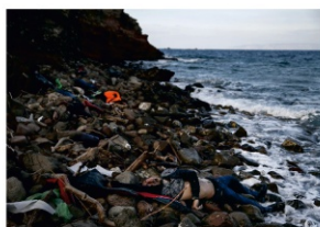
The body of an unidentified migrant is seen on a beach after being washed ashore, on the Greek island of Lesbos (Alkis Konstantinidis, Thomson Reuters - November 7, 2015).