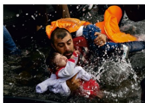
A Syrian refugee holds onto his children as he struggles to walk off a dinghy on the Greek island of Lesbos after crossing a part of the Aegean Sea from Turkey to Lesbos.