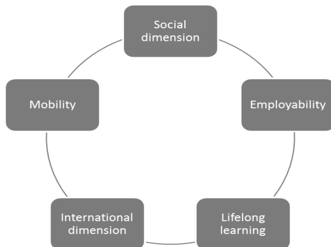
Figure 2. Policy areas of Bologna Process

individuals who have acquired core competencies for them to enter the workforce and be successful.