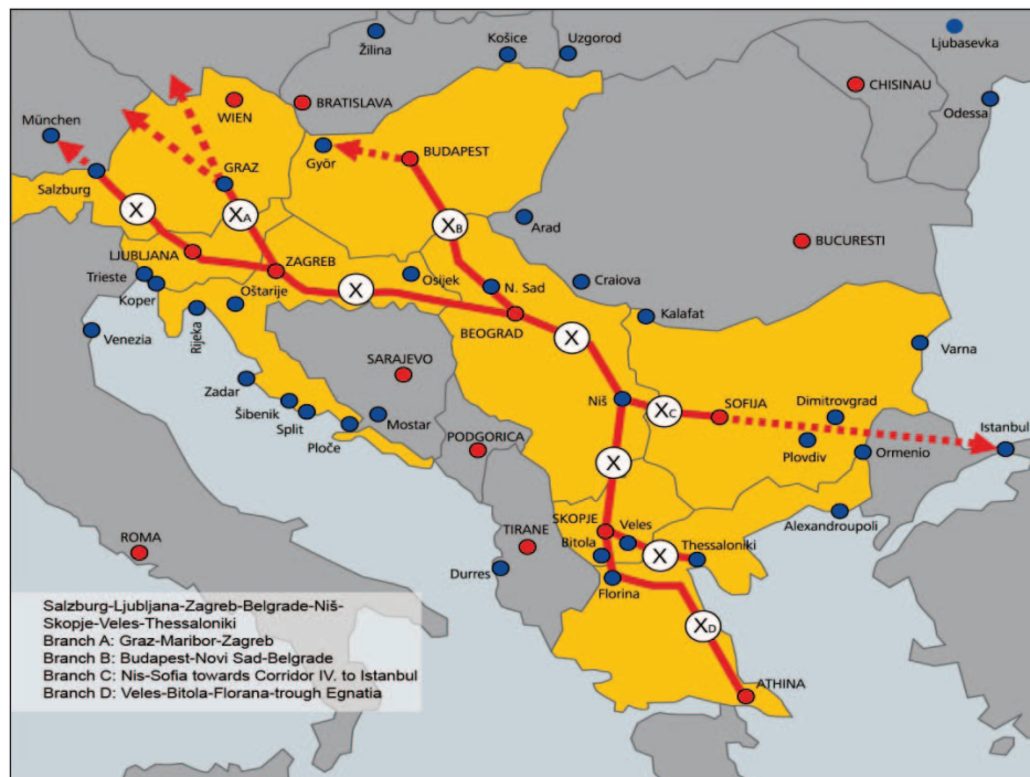
Figure 1 Pan-European transport corridor X with branches (HDZI, 2010)

Austria has expressed a great interest in the construction of the railway line for the city of Graz which would become the part of the international, national and regional rail network. The project of Krapina railway represents a special interest of the Republic of Croatia for the direct connection of railroad from Zagreb via Krapina to