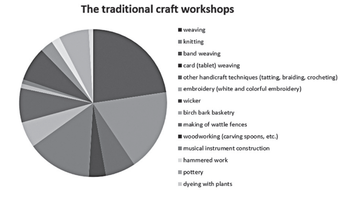
Picture 2: The traditional craft workshops in the event 'Meet your Master!' (2014)

Craft skills, in contrast to the traditional knowledge in other areas, attract the greatest interest because they manifest people's willingness to engage in various kinds of handicrafts in order to express themselves practically and creatively. Among the different areas of crafts, there are lesser known and widespread ones. In this regard, the public interest is attracted by those activities which are no longer widespread today. Thus, participants of the event can learn something new and unknown until then. Nowadays, women's handicrafts, such as knitting, are still widely practised in Latvia. If a workshop offers a particular knitting technique inherited in the family, then it is easier for the participants with previous knowledge to perceive the specific new information in the demonstrated skill. In general, it can be concluded that women's handicrafts, especially knitting and weaving, prevail among the traditional craft workshops