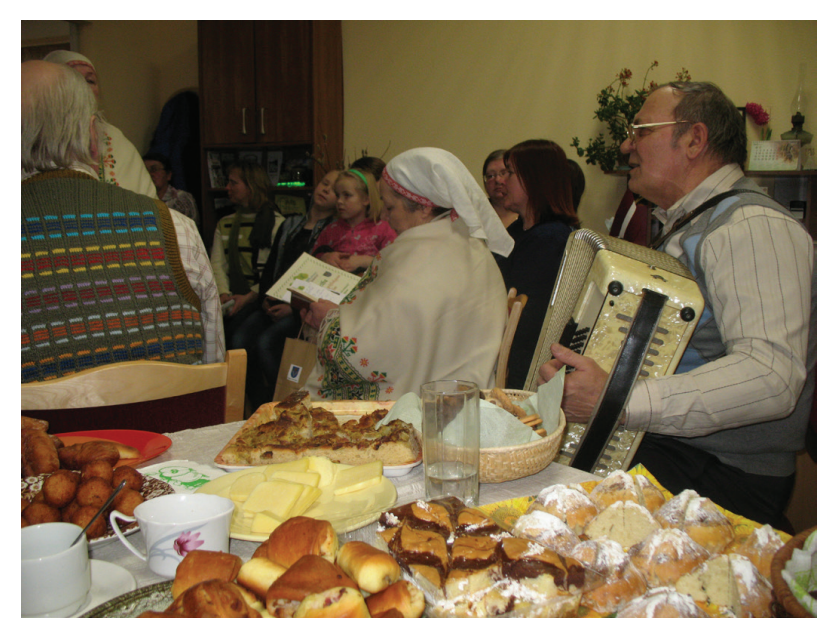
Picture 3: A workshop of 'Meet your Master!' which combine different traditional knowledge: craft demonstrations are combined with acquisition of the culinary heritage and playing folk music. Rugāji, 28 March, 2015

Among the activities of various workshops within the 'Meet your Master!' those events that combine different traditional areas are gaining an ever increasing popularity, especially in rural areas: craft demonstrations are combined with the acquisition of culinary heritage and playing folk music, singing or story-telling.