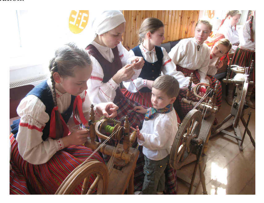
Picture 4: Girls from folklore groupe learn traditional women's work. Upīte, 27 March, 2015.

concerts, which are complemented by artisan demonstrations thus giving visitors an opportunity to try out a variety of different activities. Since in children's folk group concerts children and young people are both the participants and visitors, these events are used as a tool for active culture education.