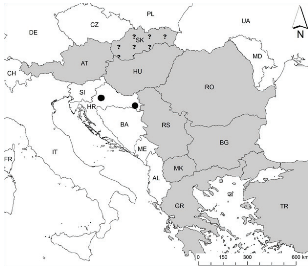
Fig. 1. Distribution of Cortodera flavimana in Europe (grey). ? – doubtful presence; ● – new records.

The longhorn beetles were collected by hand during visits to Cerna (SW of Vinkovci, Vukovar-Srijem County, 27. 4. 2008.; N: 45°11'22", E: 18°41'15") and Okuje (S of Zagreb,