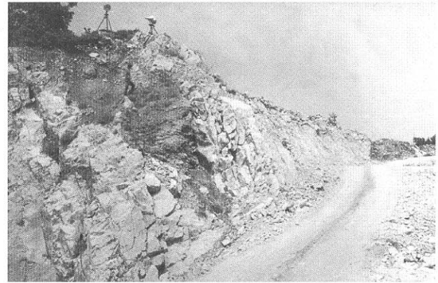
Fig. 5 Autochthonous cave sediments with fossil remains of the cave bear.

Corals rarely occur in the Črni Kal quarry. Some years ago they were concentrated at the entrance to the quarry, but this material has been removed. There also used to be the remains of a minor reef. Furthermore, a new species Cylicosmia crnikalensis KOLOSVÁRY was determined. Ten genera with 16 species have been discovered within the reef (KOLOSVÁRY, 1967).