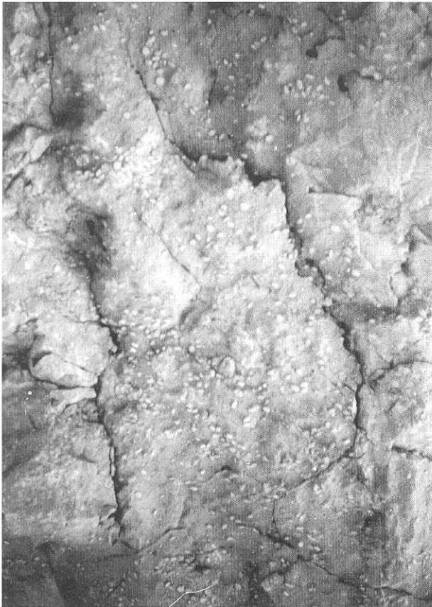
Fig. 4 Nummulitins distribution in the Eocene limestone in the quarry of Črni Kal as an example of palaeoecological events.

Some “nests” of nummulitins and their irregular distribution in the sediment are especially interesting, indicating both a partial shift of sedimentation with waves and streams, and a rough sea bottom. In this respect some parts of the quarry represent an extraordinary opportunity for the study of palaeobiocoenoses.