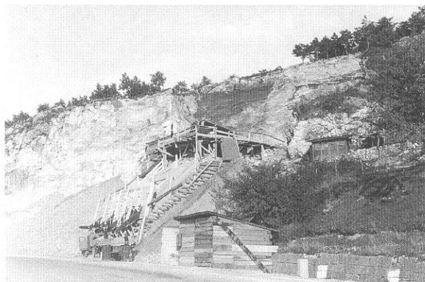
Fig. 2 The 1955 excavation of the Palaeolithic station at Črni Kal.

edly the extraction of ore in the Mežica mine could not be stopped merely because of the well-known beautiful crystals of wulfenite. Sometimes the experts fail in their choice of the best possible way to protect geotopes. In the surroundings of Drenov grič near Ljubljana there are remarkable speleothems and tectonic phenomena, interesting and important fossils, and interesting developments of the Upper Triassic strata. This area has been determined as a place of geological interest with information boards, a small geological collection and other such features. Some artistic pieces - "forma viva" - have been added. Regretfully the organizers have allowed the artists to use other rock types as well, which do not fit geologically into this environment, to the detriment of the appearance of the geotope.