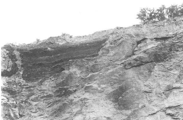
Fig. 1 A karst cave filled with sediments, a Middle Palaeolithic station, discovered in 1955 in the Črni Kal quarry.