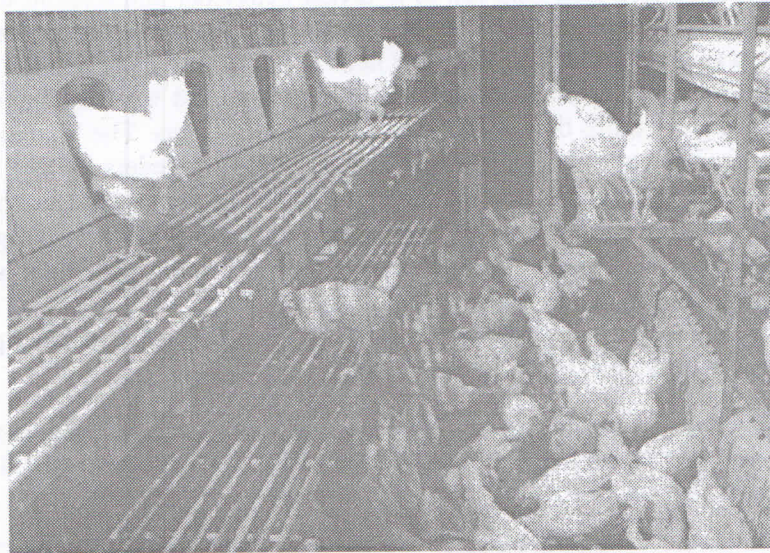
Figure 2. - HENS IN FLOOR/FREE RANGE SYSTEM