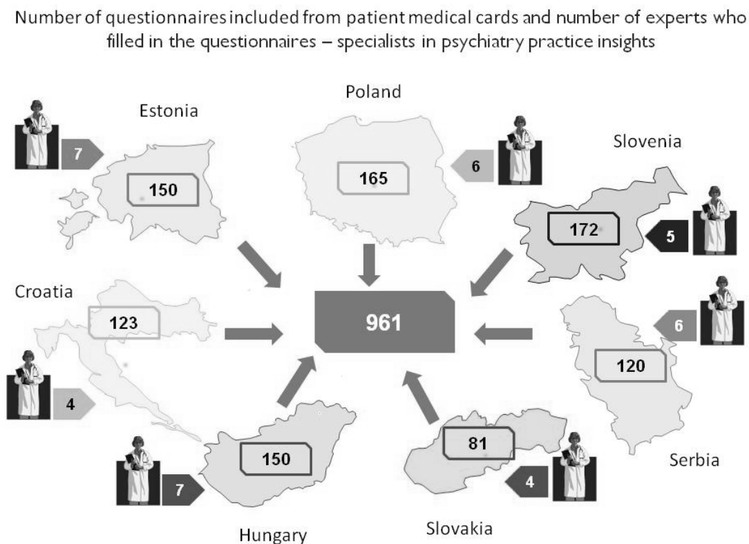
Figure 1. Study details (number of expert psychiatrists and questionnaires)

Results presented are expressed as percentages calculated both from the total sample and country-specific samples. Where data represent sample characteristics, the main statistics are presented as the arithmetic mean and median and dispersion is assessed using minimum and maximum values. Number of hospitalizations/outpatient visits and frequency of hospitalization gathered from the whole course of disease or for last five years had been converted to annual data.