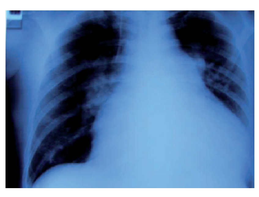
Figure 1. Cardiomegaly and increased pulmonary vascular markings on the preoperative chest X-ray.

An unrecognized AVF may lead to severe life threatening complications. In the presence of an acute large volume AVF, followed by typical symptoms, the diagnosis is usually established early. On some occasions, like lumbar surgery, early symptoms after a vascular lesion may be discrete and such lesions are easily overlooked. In patients who develop cardiac symptoms after lumbar disc surgery, diagnostic work-up for revealing the AVF is mandatory. Special attention has to be given to patients with preexisting cardiac pathology, thus masking the symptoms emerging from the AVF. Anatomic and pathophysiologic characteristics of the fistula as well as the patient's general condition are essential with regard to treatment modality. A less invasive endovascular approach is recommended as the first-line treatment option in appropriate cases. An open surgery should be considered in some unstable patients with complex pathology and in those with an unfavorable anatomy not amenable for endovascular access.