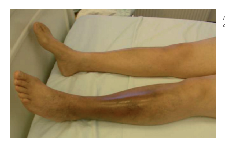
Figure 2. Edema, varicosities and skin discoloration of the patient's left calf.