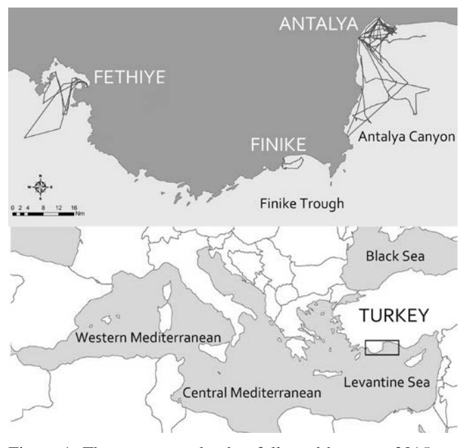
Figure 1. The survey tracks that followed between 2015 and 2016.

30th July 2016 (Figure 1). GPS points of both the research vessel and dolphin groups were recorded using the software Logger 2010, Version 5. A 'group' was defined if the distance between the individuals was less than 50 m while engaging in similar behaviour.