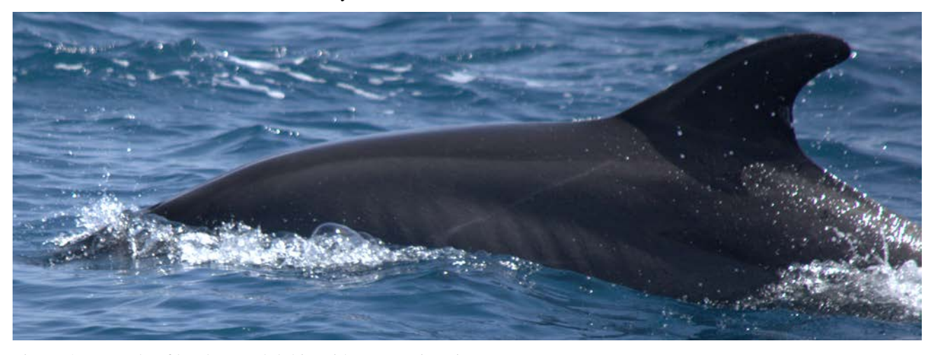
Figure 4. Example of bottlenose dolphin with a starvation sign

The coastal areas of the northwestern Levantine Sea is intensively used by fishing fleets and recreational boating and the distribution of bottlenose dolphins appeared to overlap with human activities throughout the study sites (UNPUBLISHED DATA). The negative impacts of humans on dolphins have long been demonstrated by various studies (LEMON ET AL., 2006, LUSSEAU, 2006, BAŞ ET AL., 2014). During the current study, we continuously recorded erratic diving behaviour when dolphins were subjected to the presence of marine vessels. Moreover, almost half of the photographed individuals showed distinctive starvation signs and skin parasites (Figure 4). It is likely that human activities in the northwestern Levantine Sea may take it's toll on bottlenose dolphin populations. It should be noted that there are limited established marine protected areas within this region, none of which have conservation strategies specific to cetaceans (HOYT, 2012).