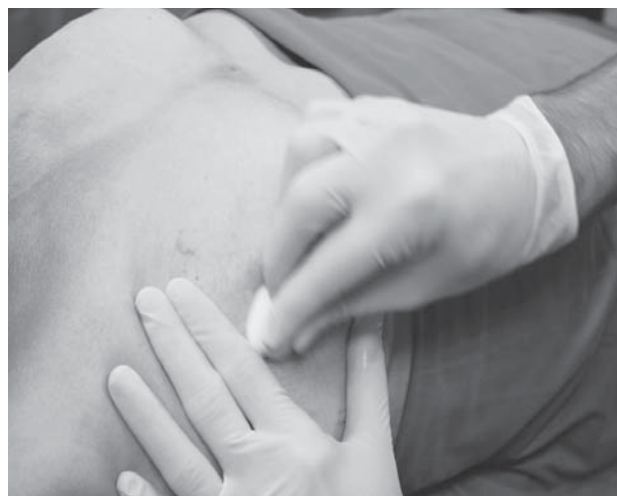
Figure 1. Application of Sienna+® suspension (a) and 5 minutes massage of the area (b).