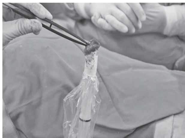
Figure 2. Detection of SIOS positive node with the probe (a) and verification of the extracted node (b)