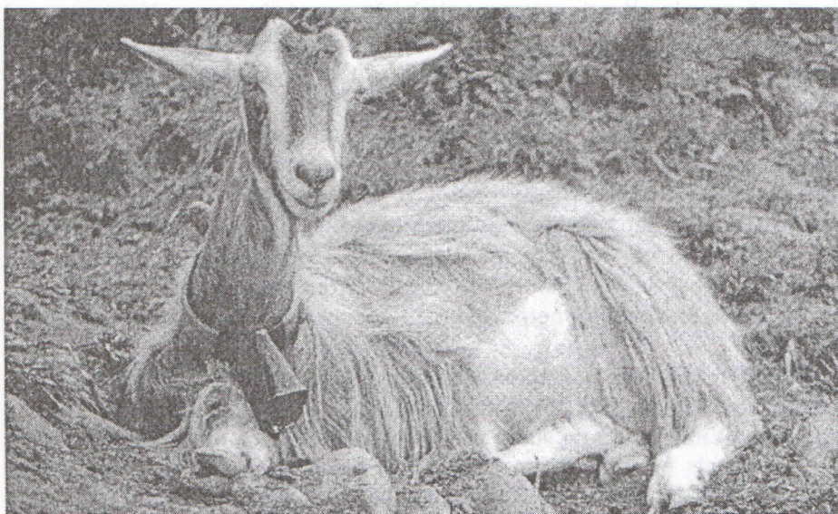
Capra Bionda dell'Adamello