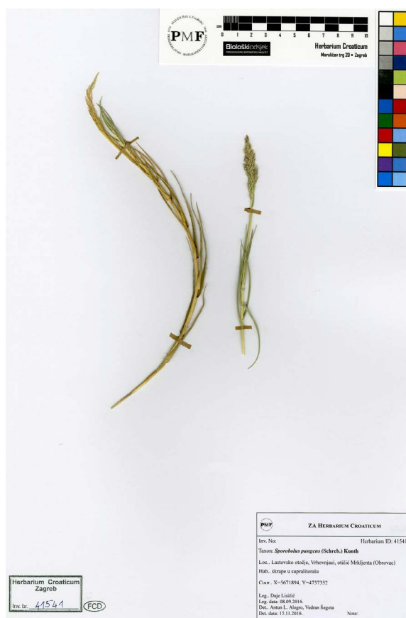
Figure 2. Sporobolus pungens , herbarium specimens from island of Mrkljenta (Obrovac), collected on 8 th September 2016. Scan photographs were obtained using A3+ scanner Expression 11000XL.