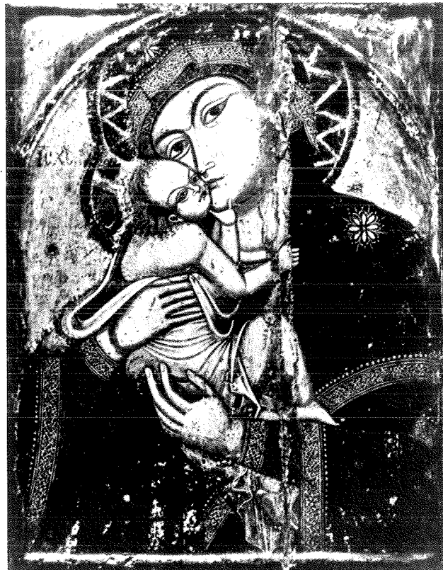
Fig. 10. Virgin with Child, Bruxelles, coll. Stoclet

The influence of the South Italian painting on this icon from Hvar cannot be denied, but what defines it among the other icons is its own individual expression. The prototypes