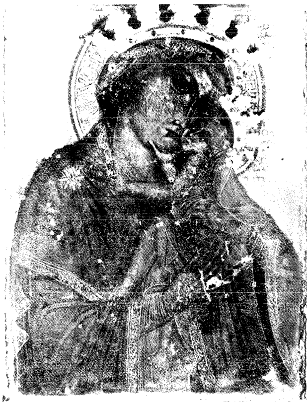
Fig. 9. Virgin with Child, S. Maria al Morocco Tavarnelle

teristic homogeneous white radiating tint around the eyes, mouth and chin of all the other icons, here these parts are covered by white hatches and characteristically red circles on the cheeks.