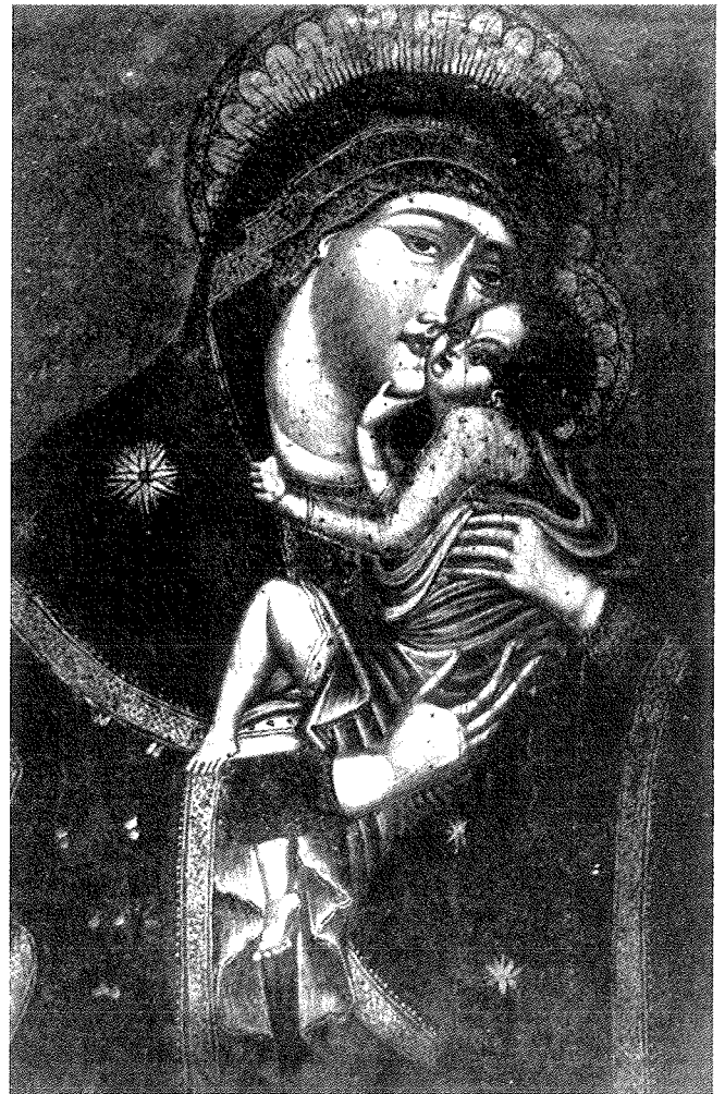
Fig. 12. Virgin with Child, Alessandria Cathedral

Biševo, points to the Benedictine monks. The origin of the icon together with its stylistic and iconographic features distinguishes it from the circle of mosaic layers of the cycle of the Passion of Innocentius III from St Mark's church in Venice, as suggested by G. Gamulin. He based his attribution on the size of the surfaces and the ornamental lines characteristic for mosaics and frescoes. But the painter of the slightly rustic Virgin from Hvar, was incapable of painting an anatomically neat right arm of Jesus. It is raised to bless in the manner alla greca , with the thumb and ring finger touching, but the fingers are malformed and twisted. Such an artist can hardly belong to the mosaicists who have laid the classically beautiful mosaics of St. Mark's. He belongs to a different cultural circle. Because the same features are found on the eastern coast of the Adriatic, I would like to point out a particular common denominator of the painting on both sides of the Adriatic, rather than applying the customary term used by Garrison Adrio-Byzantine painting.