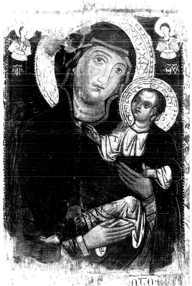
Fig. 6. Virgin with Child, Bari, Pinacoteca Provinciale (from Giovinazzo)

It can thus be suggested that this icon of the Virgin Mary, which definitely comes from the island of Biševo, was linked precisely to this church and monastery of St. Mary de Liesna . By the establishment of the bishop's seat in Hvar at the end of the 13th century, it temporarily assumed the function of the cathedral. Otherwise it would not have been possible to logically explain the continuing veneration of the church by the people of Hvar and Dalmatia and the esteem they felt for it, which is evident from the many votive gifts bestowed on it. The icon of the Virgin with the Child most certainly had a place