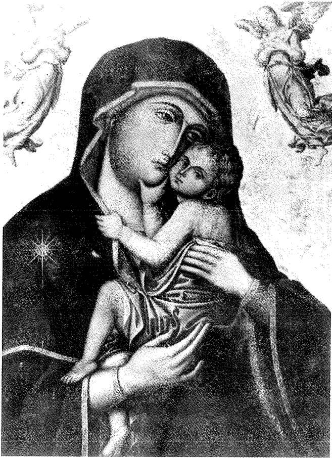
Fig. 15. Virgin with Child, Lucera Cathedral