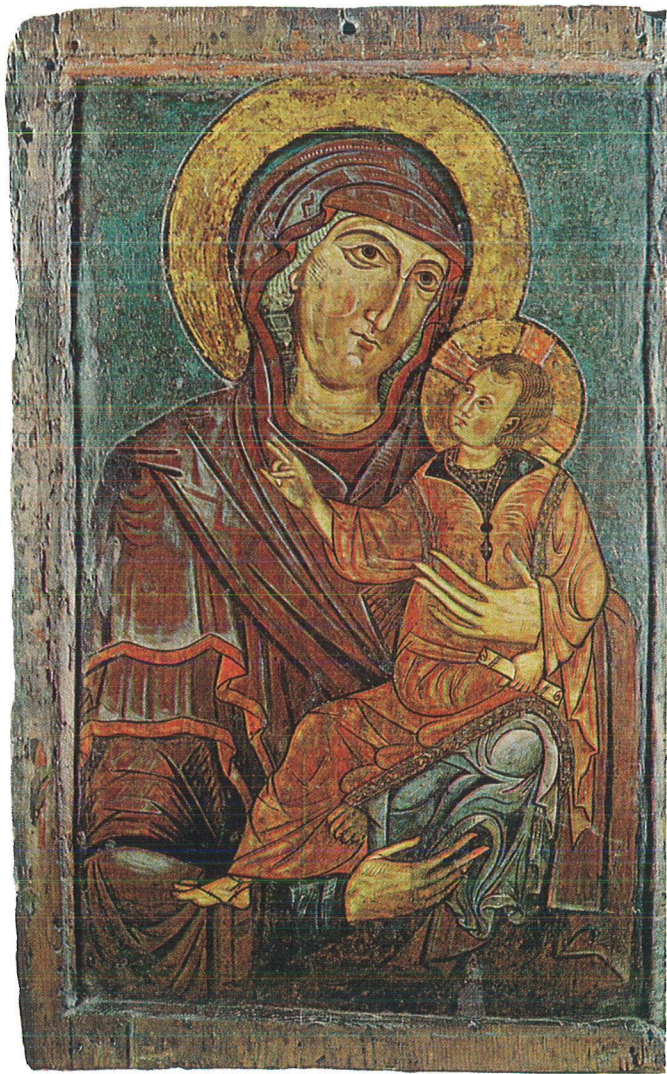
Fig. 1. Virgin with Child, Hvar Cathedral