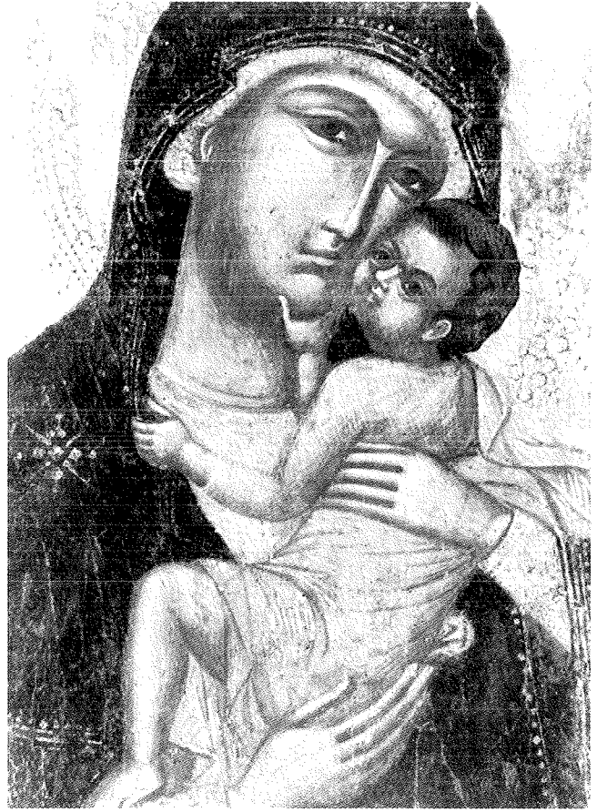
Fig. 14. Virgin with Child, Bitonto Cathedral

the origin of other known pictures of the Virgin from the end of the 13th and the beginning of the 14th century in Dalmatia and Apulia.