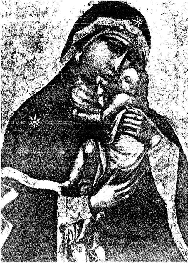
Fig. 13. Virgin with Child, Zagreb, Mimara Museum