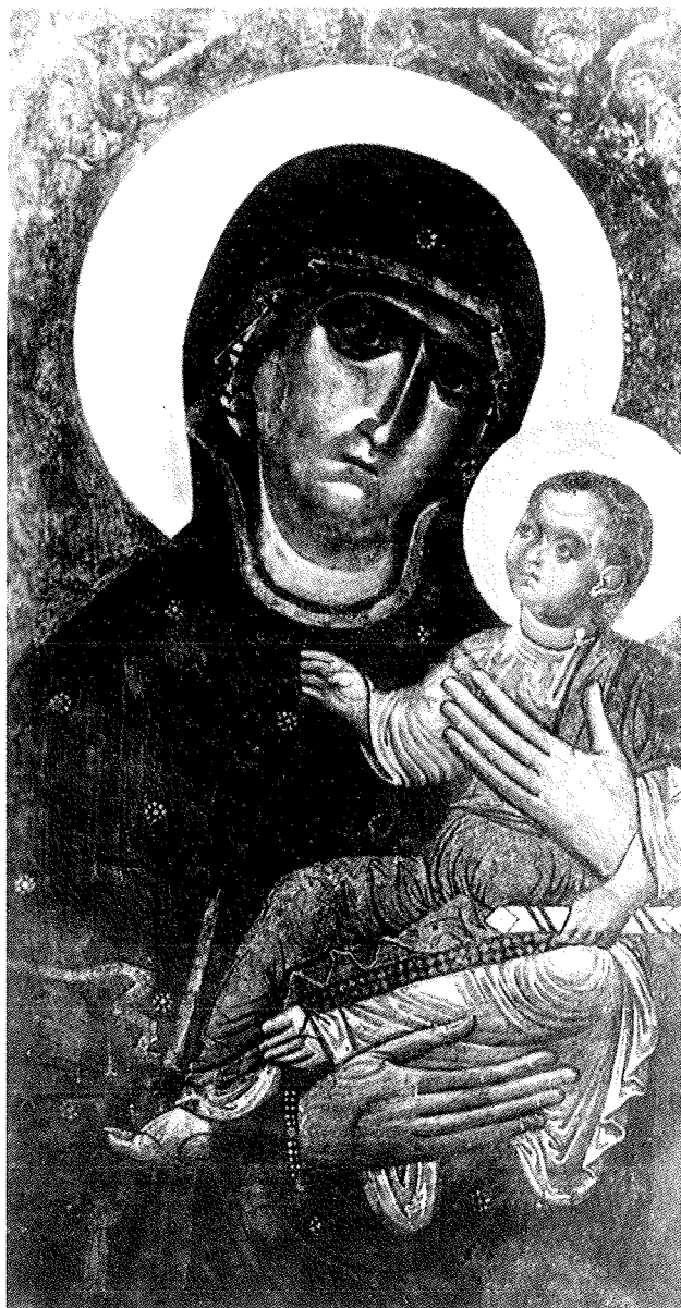
Fig. 3. Virgin with Child, S. Maria di Pulsano (lost)