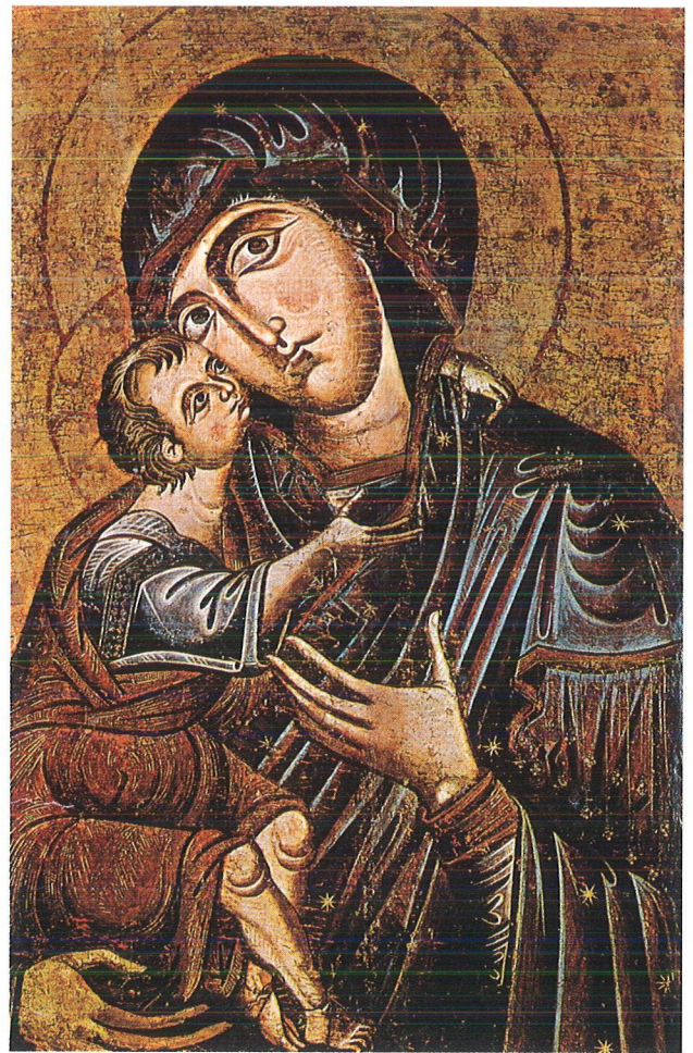
Fig. 2. Virgin with Child, Split, Our Lady of Bellfry