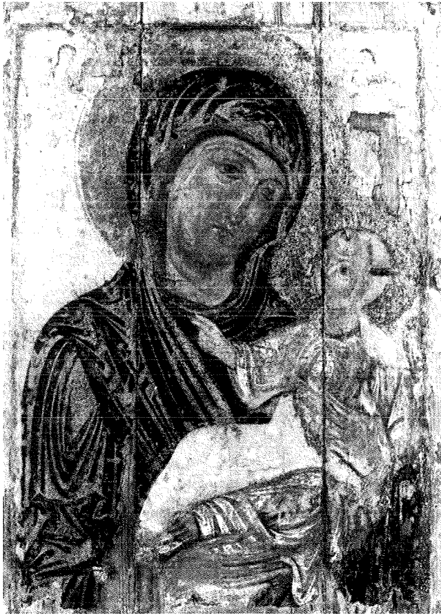
Fig. 5. Virgin with Child, Bari, Pinacoteca Provinciale

Dubrovnik made peace here also with the citizen of Zadar. St. Mary of Hvar is mentioned in the Statute of the city of Dubrovnik in 1272. The fact that the greatest and most important Dalmatian communities solved their conflicts in this particular place is very significant. The last wills preserved come from the 13th century and witness to the great esteem shown to St. Mary in Dalmatia. This concerns the citizen of Trogir in particular, who left numerous legacies to this monastery.