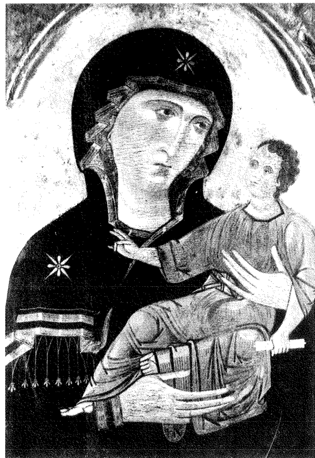
Fig. 4. Virgin with Child, Nort Carolina Museum of Art

of Vis and its cult of the Virgin. The evidence given by the canon and poet from Hvar, Ivan Ivanišević in 1650 13 , clearly settles every possible dilemma about that name. Ivanišević mentions the chapel Santa Maria de Buce, nunc de Carmeni nuncupata in the cathedral of Hvar, which was part of the mentioned benefice. It is very interesting that the venerated image of the Virgin, or as he says Dicta Gloriose dei Matris was kept on the altar behind a lintel which also had the image of the Virgin on it 14 . Describing the chapel Ivanišević solves the problem of the relationship between the old Benedictine church of St. Mary and the new cathedral of St. Stephen the Pope: translatum ex alia capellola que erat inter capellam maiorem et capellam veterem beate Mariae, sublatum tempore ampliacionis . The obvious origin of the cult of this Virgin on the island of Biševo, indicated by the name de Buce (the name of the island occurs also in the forms Busi, Buse) is therefore not irrelevant.