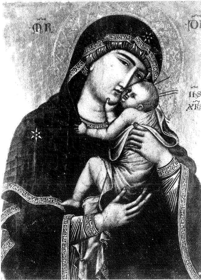
Fig. 11. Virgin with Child, Notre Dame de grâce Cambrai