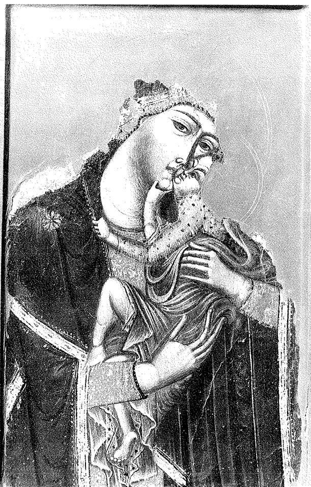
Fig. 8. Virgin with Child, Hvar church of Virgin Kruvenica

The icon of the Virgin with the Child falls outside the traditional schemes and icon painting of the 13th century 23 . Though the type of the Hodigitria is immediately recognizable, the traditional iconography is somewhat changed. The Virgin does not point at Jesus with her right hand, as it is customary in numerous Hodigitrias , implying that he is the saviour, but holds him with this hand, grasping his body from below. Jesus does not sit in his mother's lap with legs stretched out. His legs are raised, particularly the left one. Among the contemporary Hodigitria icons, there is a smaller group of an almost identical iconographic scheme, concentrated predominantly in ancient Romanesque churches of the province of Apulia in Southern Italy, and in several American museums, which acquired them only more recently 24 . Such icons of the 13th century are kept in Ciurcitano, Trani, Bari. Though the iconography is identical there are clear stylistic differences within the group. The Virgin from Hvar is distinguished from the Apulian icons by its artistic freedom, powerful brush strokes, emphasized colours. Among the icons from the western side of the Adriatic, the greatest similarity can be found in the icon stolen from the former Benedictine monastery S. Maria di Pulsano. This monastery on the coast of Monte Gargano has generated and again accepted the Benedictine abbeys of St. Mary and St. Michael on the island of Mljet.