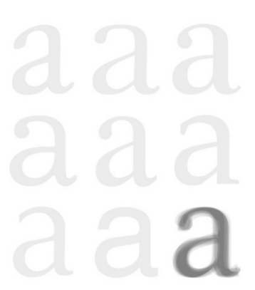
Figure 1 Model of the common skeleton according to Adrian Frutiger

RQ: Which of the formal attributes, based on the evaluation of typeface personality and the processing and analysis of data, can we single out as influential, respectively, universal?