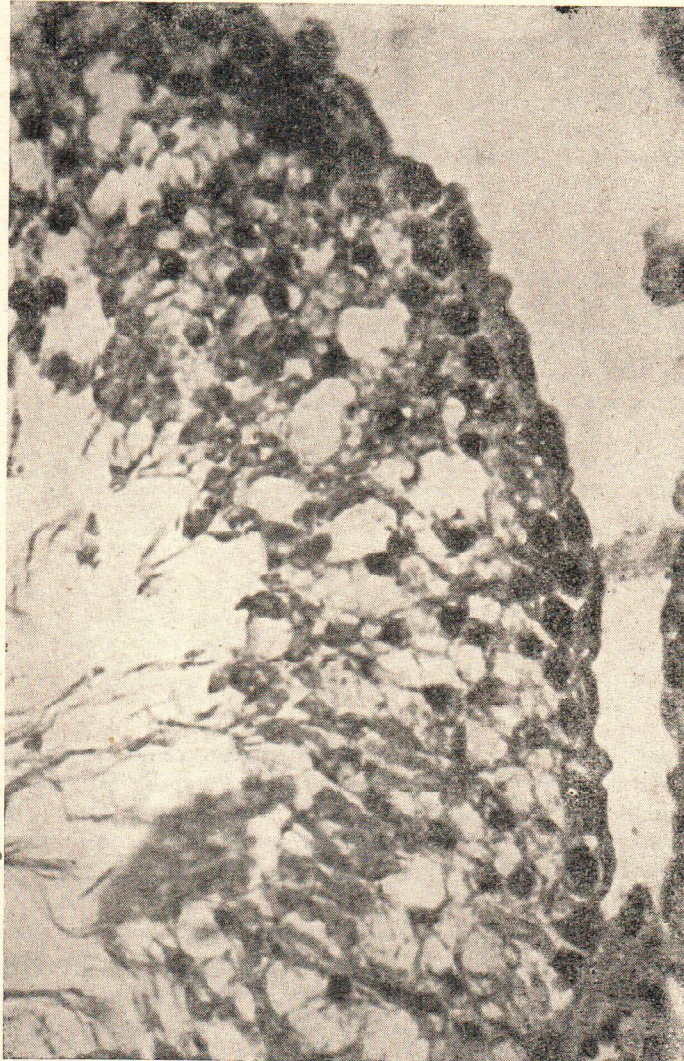
Fig. 1. Histological picture of rats' testis 6 weeks after discontinuing the exposure. Vacuolar degeneration of germinative epithelium cells is clearly visible. Whole body irradiation for 2 min. daily over 42 days. (2860 MHz, 64 mW/sq. cm.)

hrs. one, and 6 weeks after discontinuing the irradiation. In spite of the fact that exposure time (2 min.) was very short, the body temperature (measured in rectum) was raised by 2^{\circ}\text{C} and the temperature of the skin