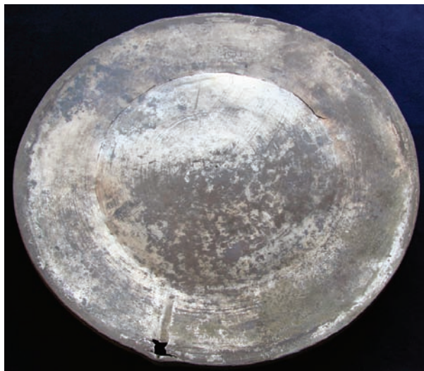
Slika 5. Tanjur 1.

režanja hrane. Kako su tragovi malobrojni, može se zaključiti da tanjur ili u uporabi nije bio dugo ili da je korišten rijetko, samo u posebnim prigodama. Na središnjem dijelu razaznaju se urezi koji bi se mogli protumačiti kao grafit, što će se moći razjasniti tek po uklanjanju naslaga.