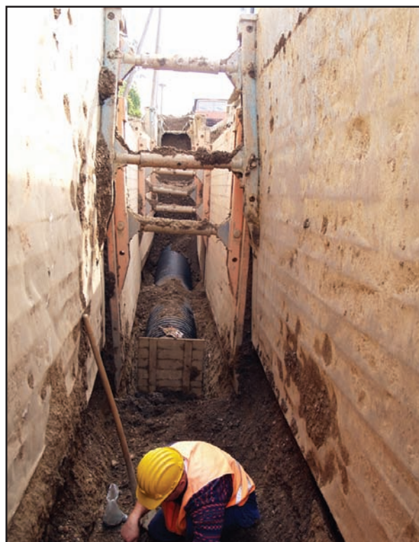
Slika 2. Iskop za kanalizacijski kolektor s mjestom nalaza (6. 10. 2005,).

of the find, documented the existing situation and took charge of the find. Since the hoard was located at the very edge of the opening for the catch drain, the imprint of a cylindrical wooden container was preserved in the profile of the dig (Fig. 1). 1 There was a small plate inside the container, while beneath it there were two larger plates, one over the other. The hoard was buried in a sterile layer of gravel at a depth of 2.5 m from the current road level. Because of the depth of the dig, braces were placed along its profile (Fig. 2), which makes it difficult to more precisely define the level of the excavation in relation to the Roman cultural stratum. At the visible portion of the excavation profile, only several metres from the position of the hoard, a Roman stratum was observed at a depth of approximately 1 m. Therefore, it can be assumed that the original depth of the hole for the hoard was approximately 1.5 m.