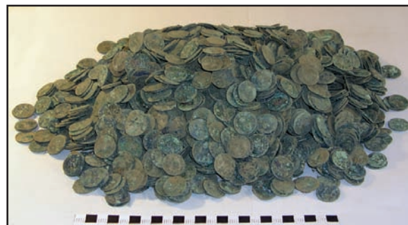
Slika 8. Dio novca iz ostave.

The composition of the hoard demonstrates the compactness and relatively short time span in which it emerged. The hoard consists exclusively of antoniniani, three denarii of Aurelian and one of Severina, and one nummus minted after Diocletian's reform of the Roman Empire's monetary system, crucial for dating the hoard.