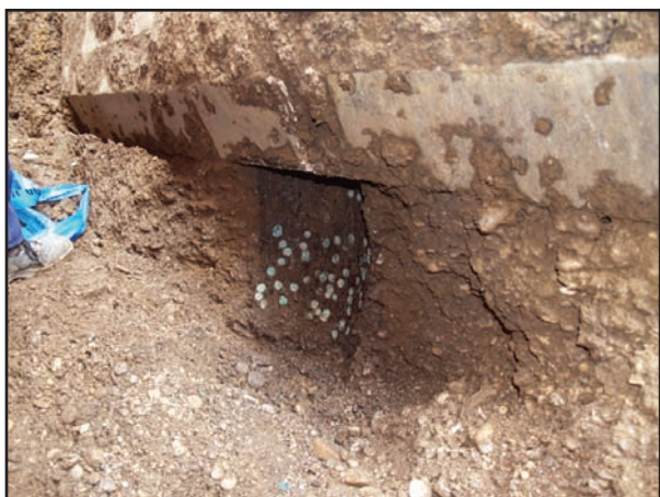
Slika 1. Pogled na mjesto nalaza (6. 10. 2005,).

stanje te preuzela nalaz. Budući da se ostava nalazila u samome rubu iskopa za kanalizacijski kolektor, u profilu je ostao sačuvan otisak cilindričnoga drvenog recipijenta (sl. 1). 1 U recipijentu je bio smješten manji tanjur, a ispod recipijenta su se nalazila dva veća tanjura smještena jedan na drugome. Ostava je bila zakopana u sterilni sloj šljunka na dubini od oko 2,5 m od današnje razine ceste. Zbog dubine iskopa uz profile su postavljeni razupori (sl. 2), što otežava preciznije definiranje razine ukopa u odnosu na rimski kulturni sloj. Na vidljivu dijelu profila iskopa, udaljenu nekoliko metara od položaja ostave, uočen je rimski sloj na dubini od oko 1 m. Prema tome može se pretpostaviti originalna dubina ukopa ostave na oko 1,5 m. Novac i tanjuri dopremljeni su u prostorije Konzervatorskog odjela Ministarstva kulture u Varaždinu gdje su prebrojeni, izvagani, razvrstani i dokumentirani. 2