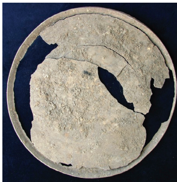
Slika 6. Tanjur 2.

Such undecorated plates were used to serve food. Production of undecorated plates with a 400 mm diameter already began in the third century, and production peaked in the fourth century.