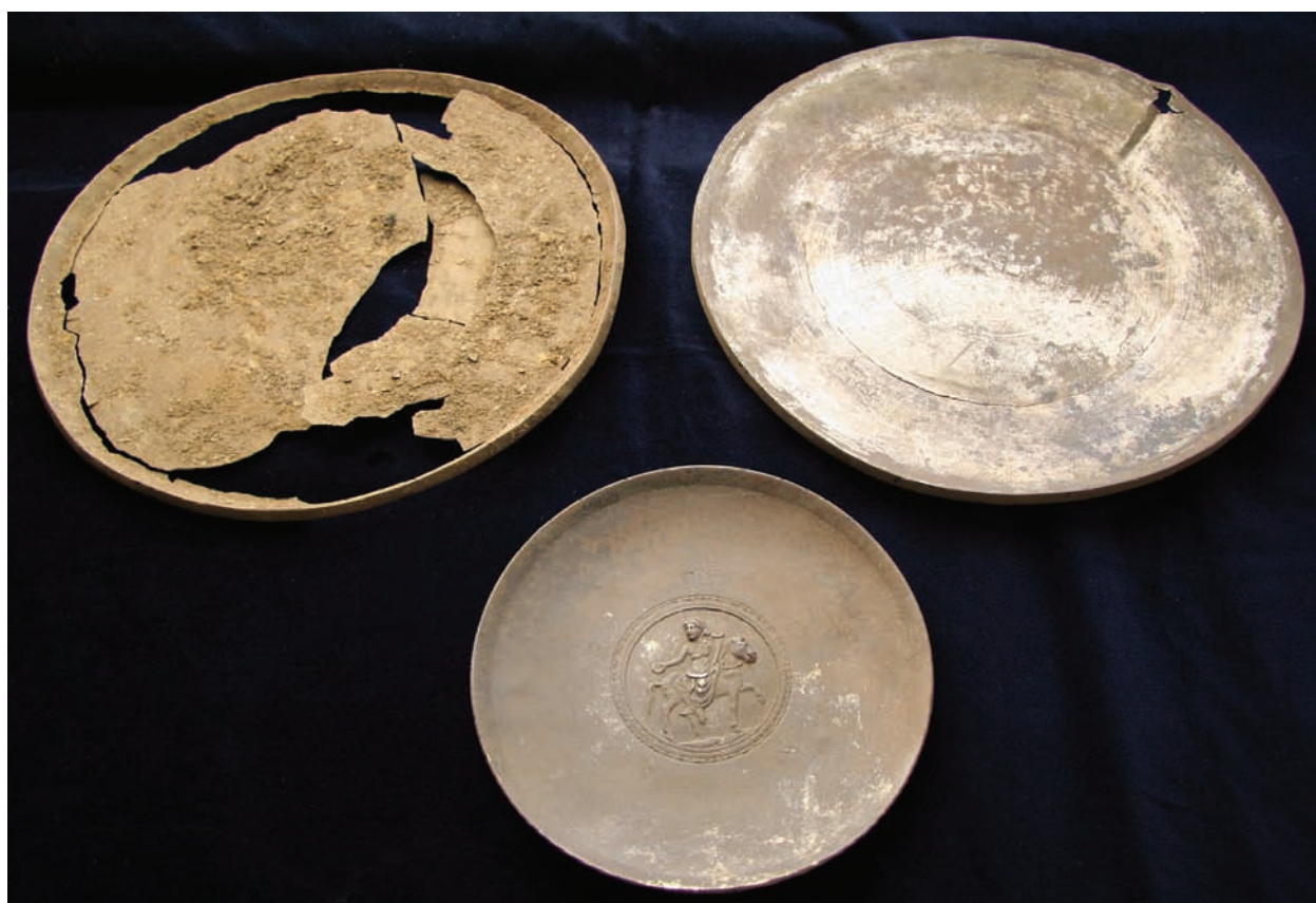
Slika 4. Srebrno posude.

The hoard found in 2005 contains three massive silver plates (Fig. 4). The two larger plates are undecorated, while the smaller plate is decorated with a figural image.