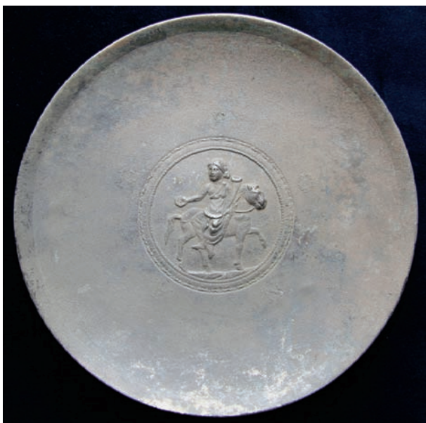
Slika 7. Eponin tanjur.

Srebrni tanjur s figuralnim prikazom pravilna je kružnog oblika (sl. 7). U središnjem dijelu tanjura nalazi se ukras u obliku pravilna kružnoga medaljona promjera 93 mm na kojem je prikazana žena na konju.