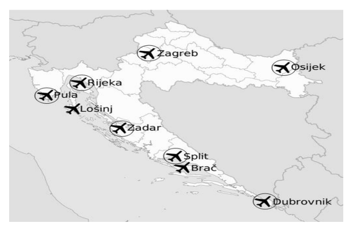
Figure 2: Seven international airports and two airfields in Croatia

slight decrease of 1.8% as compared to 2014. The airport in Pula recorded 351.658 passengers, the airport near the city of Rijeka recorded 136.849 passengers while the airport near continental city of Osijek have recorded only 29.509 passengers in 2015.