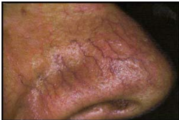
Figure 1. Telangiectasia on the nose.

This theory assumes that aging of cells results from dysfunction secondary to different biochemical abnormalities in the human body (1,7). The most meaningful biochemical abnormalities include excessive formation of reactive oxygen radicals which damage proteins and DNA, causing a loss of the ability of cellular self-repair and tissue regeneration. Another biochemical disturbance is amino acid racemization which generates improper D-isomers from natural L-amino acids. The next abnormal process is non-enzymatic glycosylation of proteins which generates incorrect cross-linking of different proteins, including collagen fibers. All of these abnormalities impair proper functioning of tissues and organs, including the skin. This leads to an abnormal response to external stimuli, epidermal barrier dysfunction, or pathological immune reactions. Hormones are another endogenous factor responsible for skin aging (7-10,12).