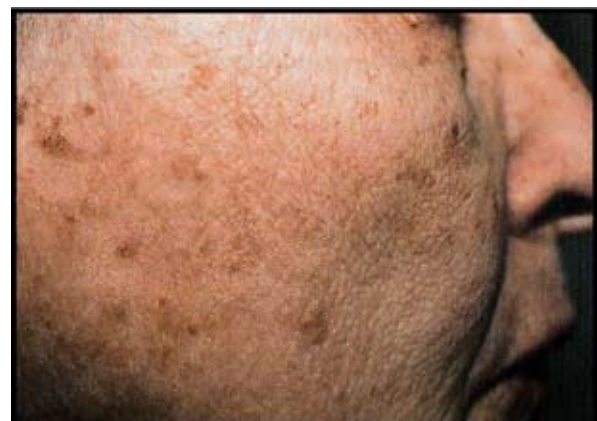
Figure 2. Photoaging.