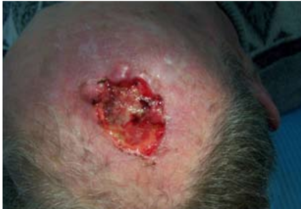
Figure 5. Squamous cell carcinoma on the skin of the head.

tory cells (lymphocytes, monocytes, granulocytes) or induce a synthesis of free oxygen radicals. Subsequently, those oxygen derivatives cause lipid peroxidation, activate transcription factors, or upregulation of the expression of metalloproteinases, destroying the extracellular matrix. Additionally, UVA indirectly damages both nuclear and mitochondrial DNA through the induction of the release of free oxygen radicals. Shorter UVB wavelengths are also capable of generating free oxygen radicals and can also directly affect cellular DNA. UVB is responsible for generating characteristic mutations in DNA through induction of the transition of cytosine bases into thymine ones (C→T). In summary, increased exposure to both natural sources of UV (sunlight) and artificial ones (suntan beds) induces photo-aging and a development of precancerous (Figure 3 and Figure 4) or cancerous (Figure 5) conditions of the skin.