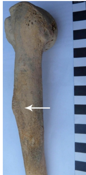
Figure 8. Deltoid muscle attachments on a humerus; robusticity score 3.