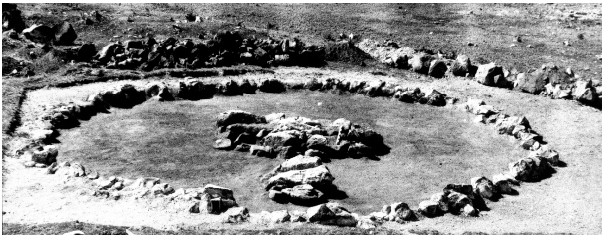
Figure 2. Burial 221 from Lchashen.

Calculus may harbour pathogenic bacteria which may lead to periodontal disease. Some authors defend that calculus deposition may be mainly related to consumption of protein-rich food, as fish or meat (46), whereas others have found that diets rich in carbohydrates may promote calculus deposition (47). It can be explained more logically by a specific occupational activity of the Sevan Basin inhabitants, which in turn points towards fishing activity.