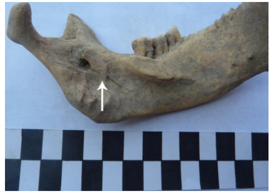
Figure 4. Non-metric trait/normal variation in the skeleton (sulcus mylohyoideus)

the edge of the glenoid of the scapula on the humerus shaft has led to a depression and loss of bone in the area below the humeral neck of both arms. The traits that characterize habitual horse-riders were observed in femora (Figure 9). These include hypertrophied ligament attachment areas around the fovea of the femur, as well as a pronounced linear aspera which supports attachment of the muscles that a rider uses to grip the back of the horse (50).