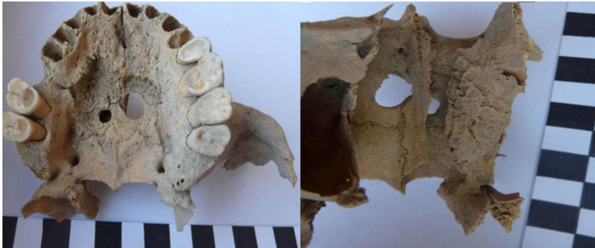
Figure 1. Perforation of the hard palate, with two small defects in the hard palate.