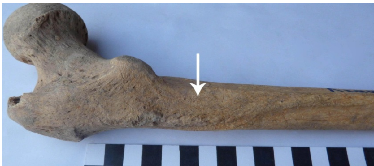
Figure 9. Left femur of skeleton, enthesopathies for gluteus maximus.

Reddy (54) discusses etiologies for the occurrence of maxillary sinusitis in archaeological populations such as air pollution from different fuels, the aridity or humidity within environment, the diet of the people and dental pathology. Cooking and heating with solid fuels both lead to high levels of indoor air pollution, mainly a complex mix of health-damaging pollutants (e.g. particulate matter and carbon monoxide) (55). Many studies examine the effect of exposure to smoke by humans, with a particular focus on mothers and children. At the same time infants are exposed to pollutants as they are close to their mothers when they are engaged in domestic chores. Even after the cooking is finished, smoke lingers in the house for a long time as there are no windows. Not only is the environment inside the house polluted but also, the outside environment is contaminated with dust and other particles which create irritation in the upper respiratory tract. In the ancient societies, with the advancement in technology and agricultural production, many different occupational activities developed. It is evident