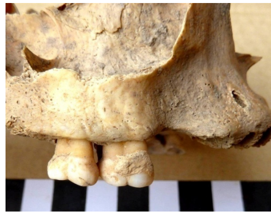
Figure 5. Periodontal disease, tooth lost antemortem and dental calculus