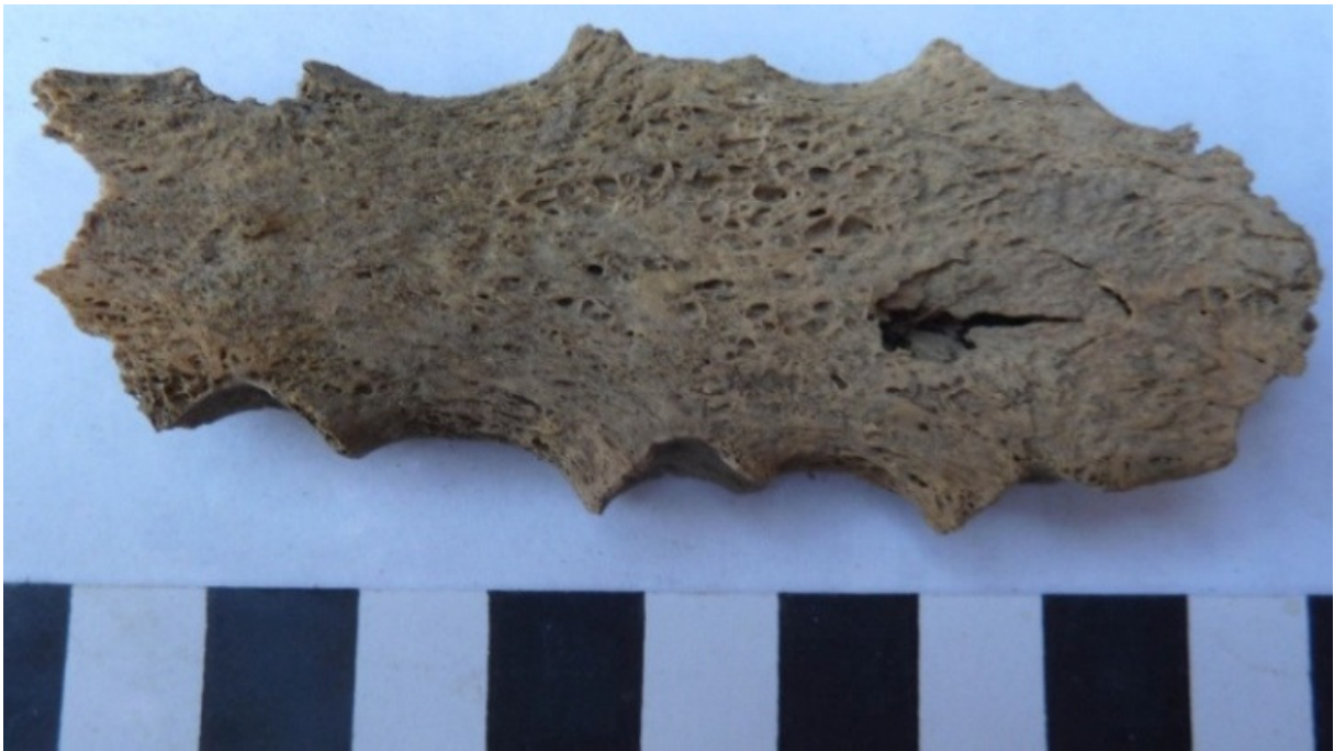
Figure 6. Tuberculosis of sternum.