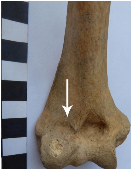
Figure 7. Radial fossa on the distal end of the humerus.