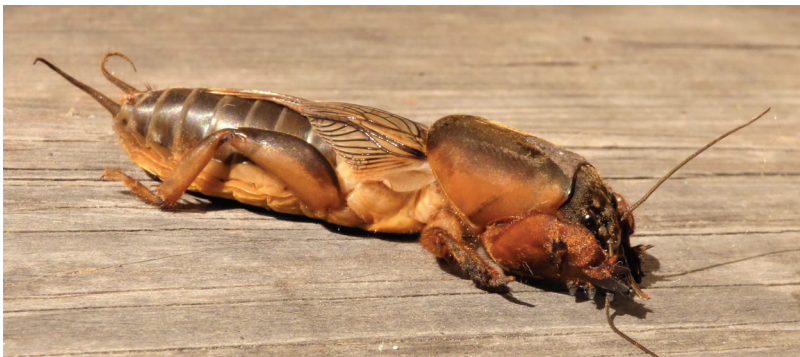
Fig. 2. A female of Gryllotalpa stepposa from Valpovo (Croatia).

Epiphallus (Fig. 3 A) is more slender and with a narrower apical half than in G. gryllotalpa , the same as in G. stepposa (ZHANTIEV, 1991; IORGU et al. (2016) 2017: Fig.1 K) and G. krimbasi (INGRISCH et al. , 2008; IORGU et al. , 2016). Epiphallus length: width near apex ratio