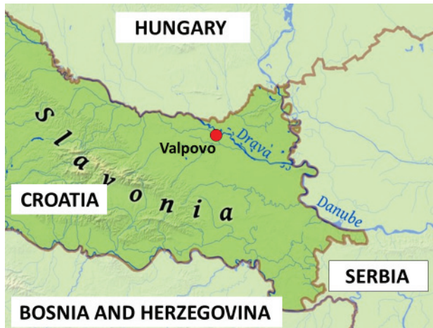
Fig. 1. Map of locality where Gryllotalpa stepposa was found.

morph is present. BENNET-CLARK (1970) described Western European species G. vineae from France, and redescribed Gryllotalpa gryllotalpa after a specimen (probably a type specimen, not a Neotype) from Norwick (England), stored in the collection of Linnean Society in London. Precise location of the locus typicus of G. gryllotalpa is still uncertain, noted as „Europa” in HARZ (1969) and Orthoptera Species File (CIGLIANO et al. , 2017).