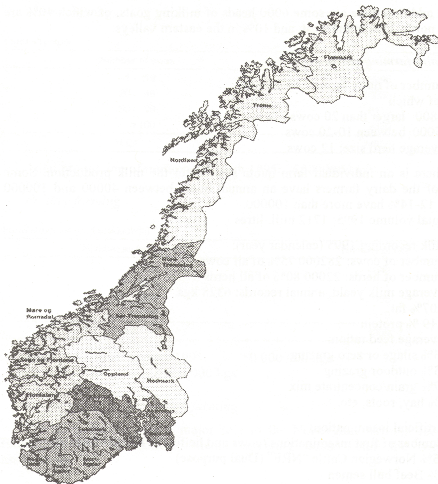
Livestock (31. 12. 95 '000)