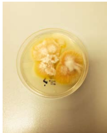
Figure 2. Culture of M. canis on modified Sabouraud dextrose agar.

The previously prescribed treatment by the patient's general physician, consisting of topical corticosteroids (alclometasonum dipropionate, betamethasone), topical mupirocinum, and clotrimazole, was not successful. Furthermore, new satellite infiltrated plaques appeared at the site of infection. Further examination had been performed at the Reference Centre for Dermatological Mycology and Parasitology of the Ministry of Health of Republic of Croatia. Fungal culture on a modified Sabouraud dextrose medium showed flat, white to creamy, spread-out colonies with a cottony surface and golden brownish-yellow reversed pigment (Figure 2). Diagnosis of kerion due to M. canis was established. M. canis was also confirmed in the isolate by the use of the polymerase chain reaction-restriction fragment length polymorphism (PCR-RFLP) molecular methods. For this purpose, ITS1 and ITS4 universal primers were used to amplify the ITS1-5.8S ITS2 of rDNA region. The RFLP analysis of the PCR products of the isolated strain and