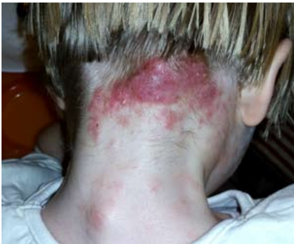
Figure 1. Acute inflammation with tumorous mass, pustules, and loss of hair in the occipital region.

region of the scalp was examined at our Department. Almost complete loss of hair, a few satellite plaques with pustules on the surface, and exudation from some of the follicular orifices could be observed (Figure 1). Multiple annular lesions were spread over the neck and shoulders. Additionally, papular exanthema of the trunk and bilateral cervical lymphadenopathy were present. The patient was in otherwise good condition, and routine laboratory investigations were all within the normal limits.