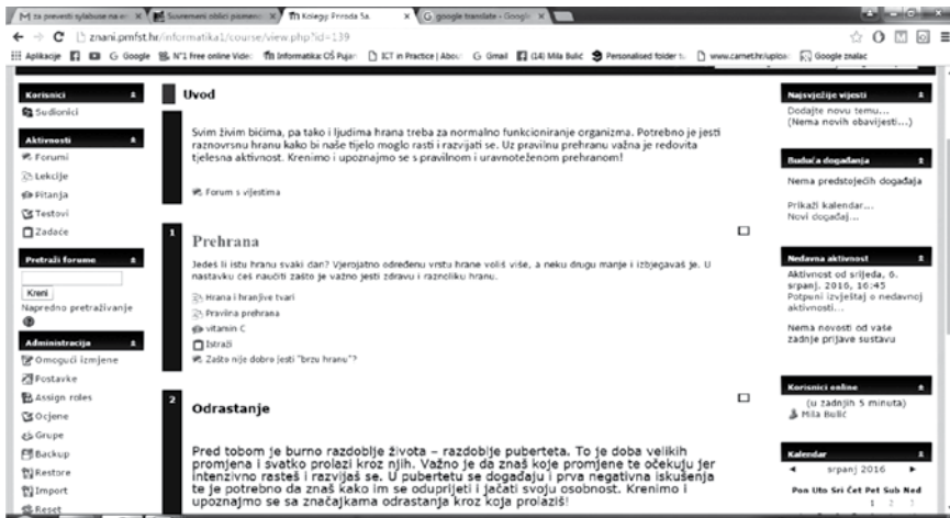
Figure 1. The layout of the first page of the user interface on Moodle

In case vagueness of the task should appear, pupils were instructed to ask for help from the teacher using electronic mail or asking questions at Forum with news , which was available to all users even before they started their e-learning.