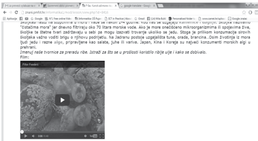
Figure 2. Moodle site layout with the teaching contents and video recording

In order for pupils in the experimental group to be successful in independent learning using Moodle , the teaching contents of Science and Biology were divided into smaller, independent logical units named in the Lesson menu at the left side of the interface. They could access the content by simple selection of searched area. Textual teaching content of specific teaching units was amended with different visual and audio-visual sources, photographs, illustrations, graphs, 3D model displays and video recordings and animations (Figure 2). The above mentioned was done with the aim to help pupils in the acquisition of necessary learning outcomes.