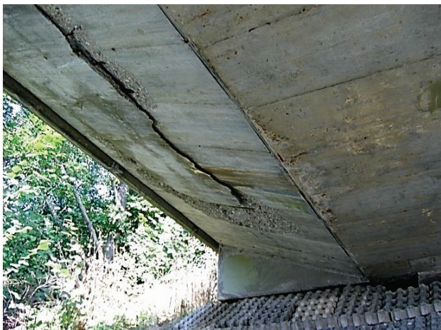
Figure 1 Example of deterioration of the main beam (superstructure) where intervention is urgent.

For the particular case under consideration, the decision model is to be developed on the basis of several criteria and their relative importance. The most obvious criterion to be used is the condition rating R that quantifies the deterioration level of the pass under consideration.