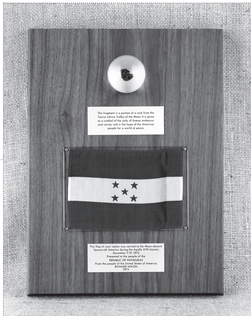
SL. 1 – TIPIČNA GOODWILL MOON ROCK PLAKETA, 1973.