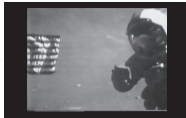
FIG. 4 – HARRISON SCHMITT OBSERVING THE 70017 SAMPLE DURING THE APOLLO 17 MISSION, 1972.

lunar surrounding. A body has to be, paradoxically, quarantined from the outer space vacuum, and immersed into a terrestrial nature, a favorable mixture of oxygen, hydrogen and nitrogen reproduced inside a purposefully designed anthropomorphic shell – inside an astronaut's suit. Only inside such a tiny, confined and localized environment a body can produce that other, outer space. However, that space can never be a true extension of the body as an astronaut is never envired by the outer space, but quite contrary, quarantined from it. Being out there , in the outer space, is a mere illusion: a temporary exclave of the Earth's atmosphere, both figuratively and literally. The lunar space is a time-window that only Apollo missions have successfully opened: an illusion created by the technological and logistical capacities of a designed environment. While producing the outer space, an astronaut occupies the same nature that the life on Earth is a part of. Only that earthly nature, localized through the explicatory potential of a designed apparatus, provides a substrate for subsequent spatial production. The outer space is always a function of the terrestrial, and containment is its ontology.