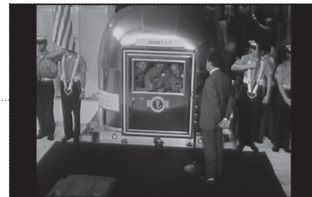
SL. 2 – PREDŠJEDNIK NIXON OBRAČA SE ČLANOVIMA MISIJE APOLLO 11 PO NJIHOVU POVRÄTAKU NA ZEMLJU, 1969.

KLJUČNE RIJEČI: Hladni rat, geopolitika, svemir, proizvodnja prostora, teritorij