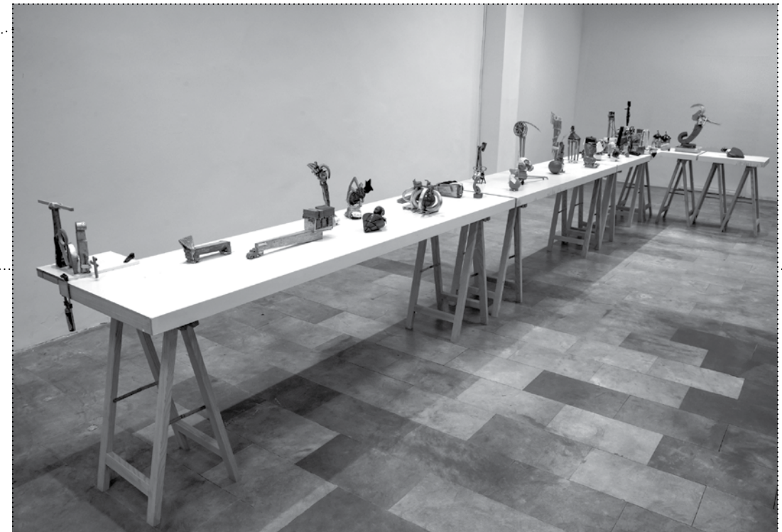
MRDJAN BAJIĆ, TRASH, FROM THE EXHIBITION MRDJAN BAJIĆ: THE BLUE DANUBE, GALLERY OF CONTEMPORARY ART SMEDEREVO, 2013. PHOTO: VLADIMIR PERIĆ, ©MRDJAN BAJIĆ