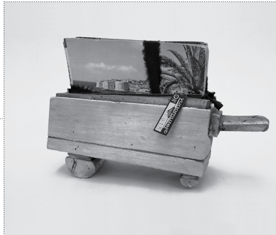
MRDŽAN BAJIĆ, TRASH: PUNO POZDRAVA ŠA LEPOG JADRANA, 1999.–2007., FOTOGRAFIJA VLADIMIR PERIĆ, ©MRDŽAN BAJIĆ

arhivskog materijala kao nađenog, a ipak konstruiranog, faktualnog, ali i fiktivnog, zatim javnog kao i privatnog. 10 ..... U društvenom, značenjskom i funkcionalnom kontekstu nasuprot arhivu stoji otpad, kao mjesto na koje se „skupljaju“ predmeti i materijali koji nisu ispunili kriterije da budu sačuvani, odnosno odabrani kako bi zbog svoga značenja bili historizirani premještanjem na mjesto kolektivnog ili individualnog pamćenja. Otpad je u strukturalnom smislu svojevrsna vrsta arhiva, s tim što joj se po funkciji suprotstavlja. I arhiv i otpad, budući da se mogu promatrati kao simptomi kulturološkog pamćenja i zaborava, reflektiraju aktualne odnose prema prošlosti unutar društva te su zbog toga čest predmet istraživanja umjetnika, filozofa i drugih istraživača. 11