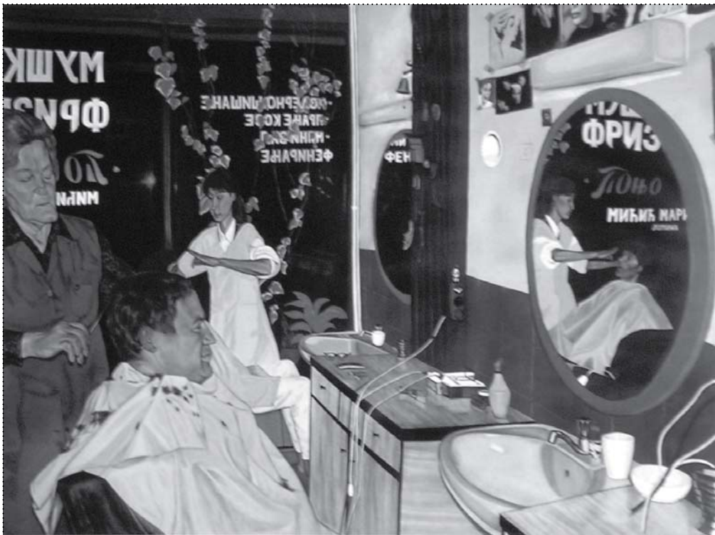
POJAM UNDERGROUND U UMJETNOSTI U SRBIJI DEVESESTIH