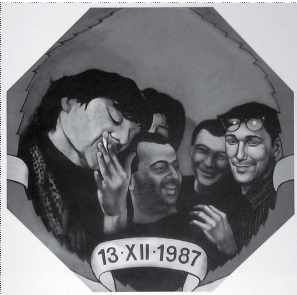
THE NOTION OF UNDERGROUND IN SERBIAN ART DURING THE 1990S