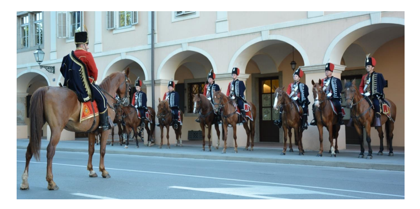
Figure 2 - The historical Bjelovar border troops - Hussars 1756 in Bjelovar at cultural manifestation Terezijana in May 2016

For insight into the current state of Gidran population in Croatia and their protection, the aim of this study was to evaluate the phenotypic characteristics of Gidran breed in Croatia, which is one of the criteria for selection indicated by breeding program. In addition, their comparison with the Hungarian populations of Gidran and Nonius which took part in Gidrans history by crossing we will get insight about their relationship.