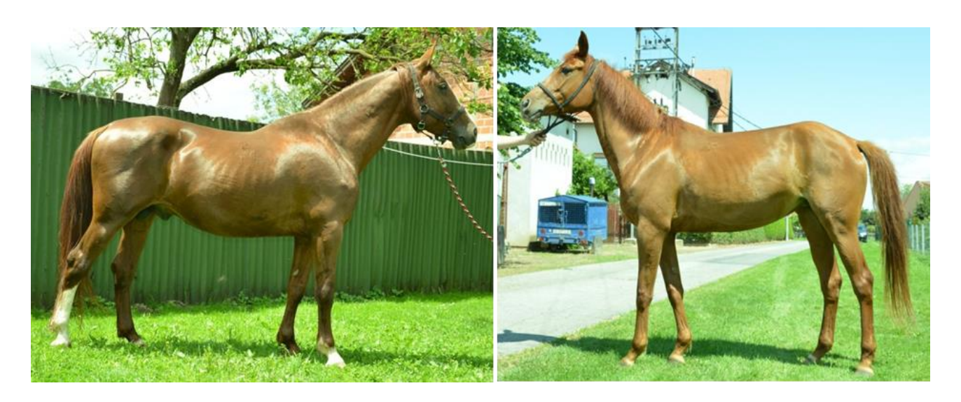
Figure 1 - Stallion (12 years old) and mare (6 years old) of Gidran breed in Croatia (photo taken in June 2016)

Breeding of Gidran horses was always present in Croatia especially in the northern areas where they were used as warhorses by hussar military cavalry troops established in Bjelovar as far back as 1756. In 1880's due to its excellent abilities and great possibility of utilisation in almost every stallion stables in northern part of Croatia there was Gidran horses among Thoroughbreds, Lipizzan, Nonius horses and others (N N , 1885). Therefore, through history there are strong indications that Gidran breed on Croatian territory has the character of a traditional breed. Reintroduction of this