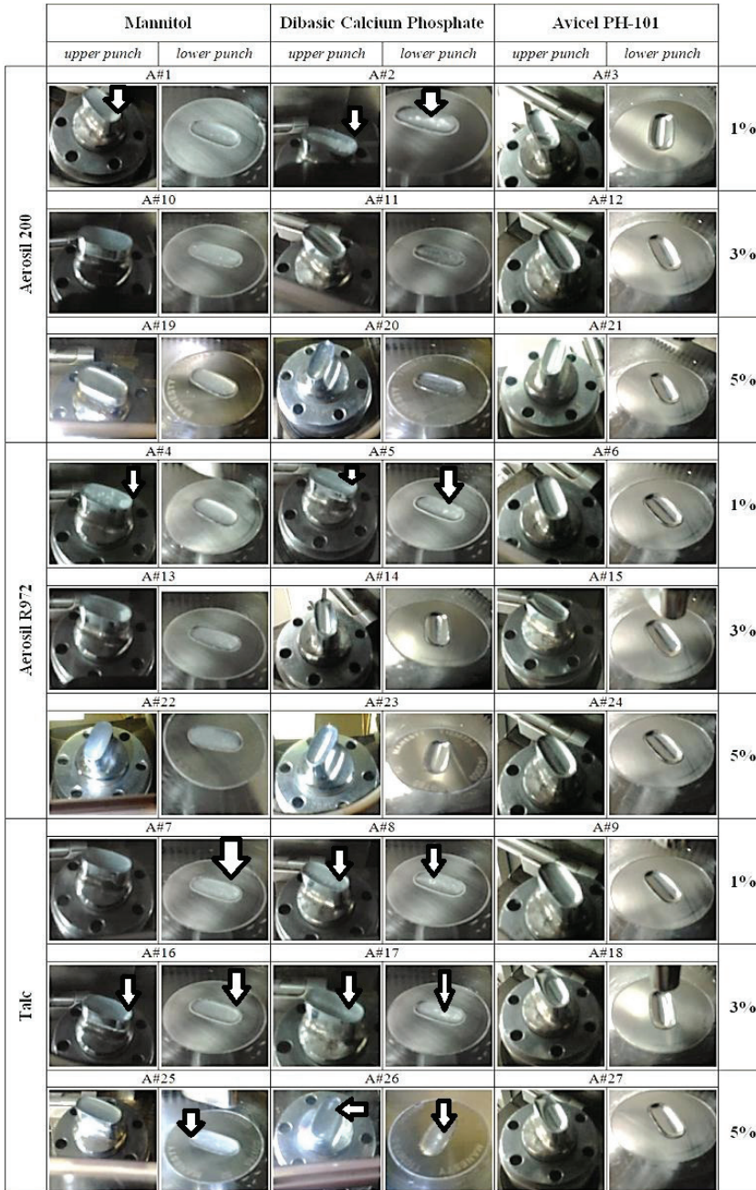
Fig. 2. Photograph of upper and lower punches after compression of L-carnitine-L-tartrate tablet formulations with formulations that showed sticking.