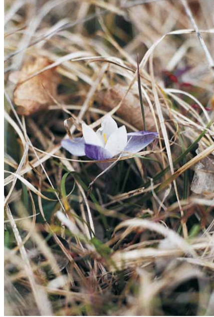
Fig. 4. Crocus weldenii f. bicolor Pavletić Zi. & Trinajstić