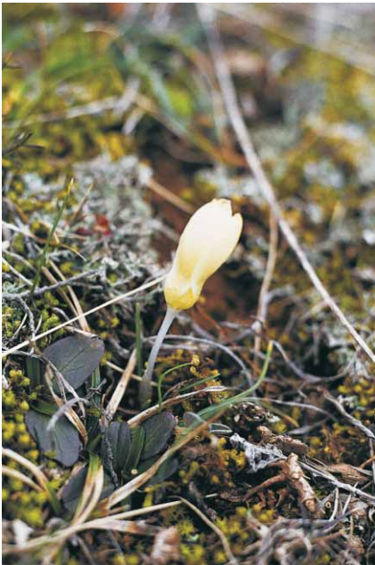
Fig. 5. Crocus weldenii f. lutescens Pulević