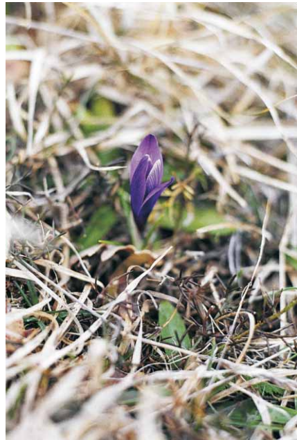
Fig. 6. Crocus tommasinianus Herbert