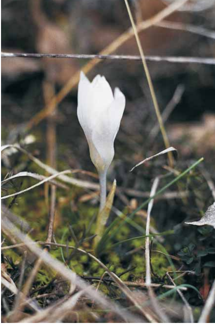
Fig. 3. Crocus weldenii f. weldenii